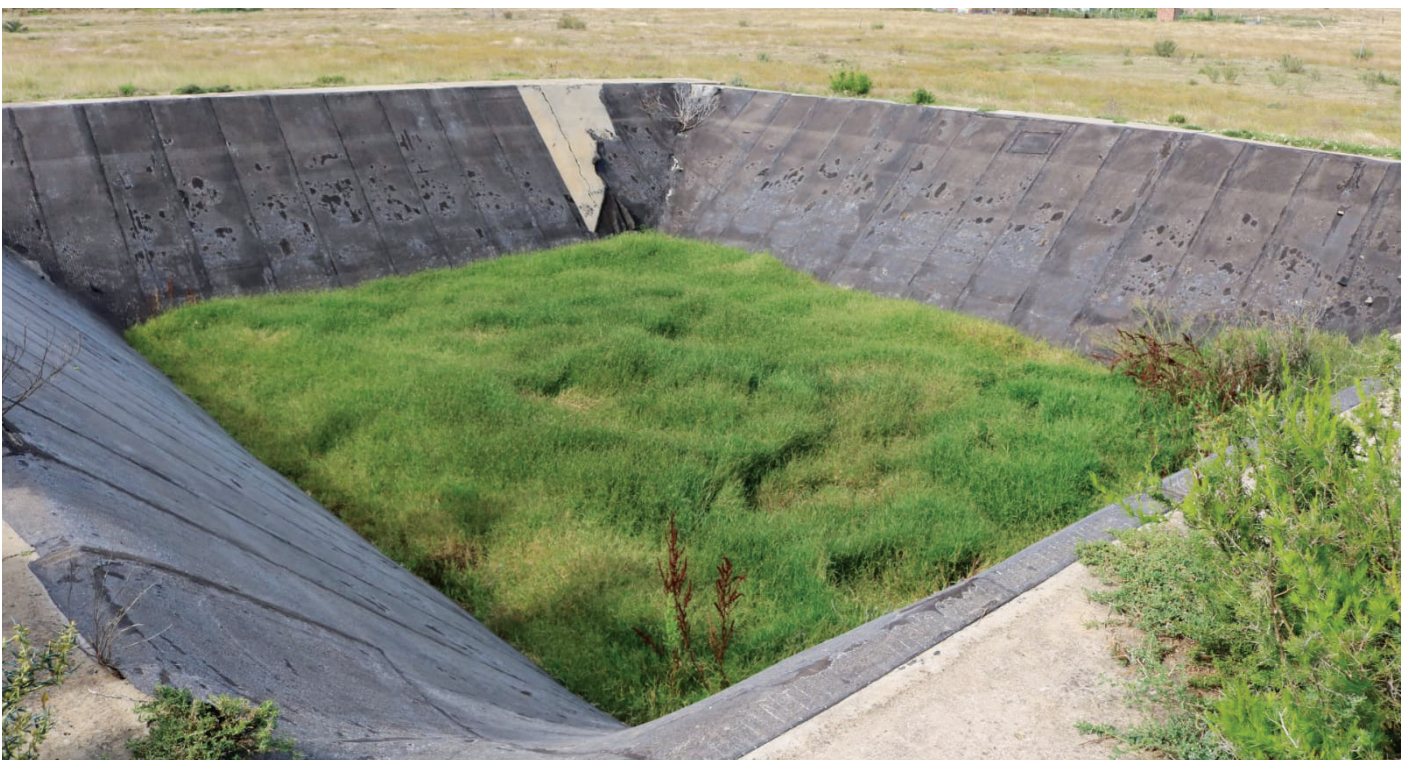
Overgrown ponds in the Kopanong municipality lead to poor water service delivery.

In Reddersburg, all ponds were dry, as there are no pumps. Also, animals could easily enter the facility and there was cow dung strewn all over the facility. NCOP