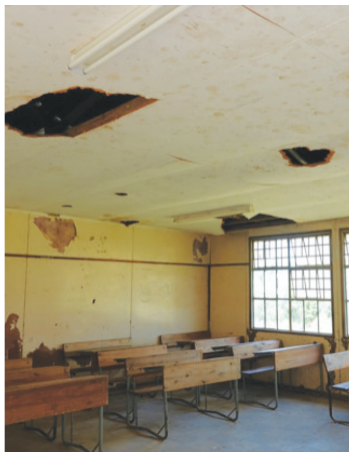
The delegates focused on infrastructure, scholar transport, and water and sanitation.

who stay far away from schools. The delegates heard that the community had built Mncwathi and Lundini Secondary Schools