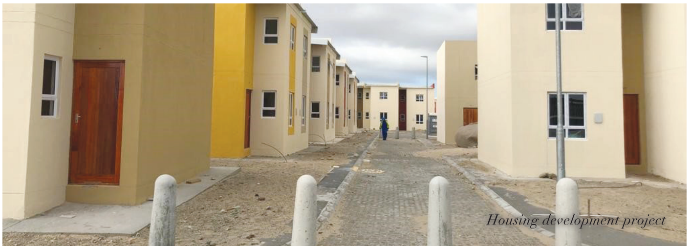
Housing development project

To ensure there's transparency and openness in how this project unfolds from inception to completion, he added, "We have enlisted two liaison officers from Woodlands and Kosovo Informal Settlement to constantly update their respective communities about the timeframes and