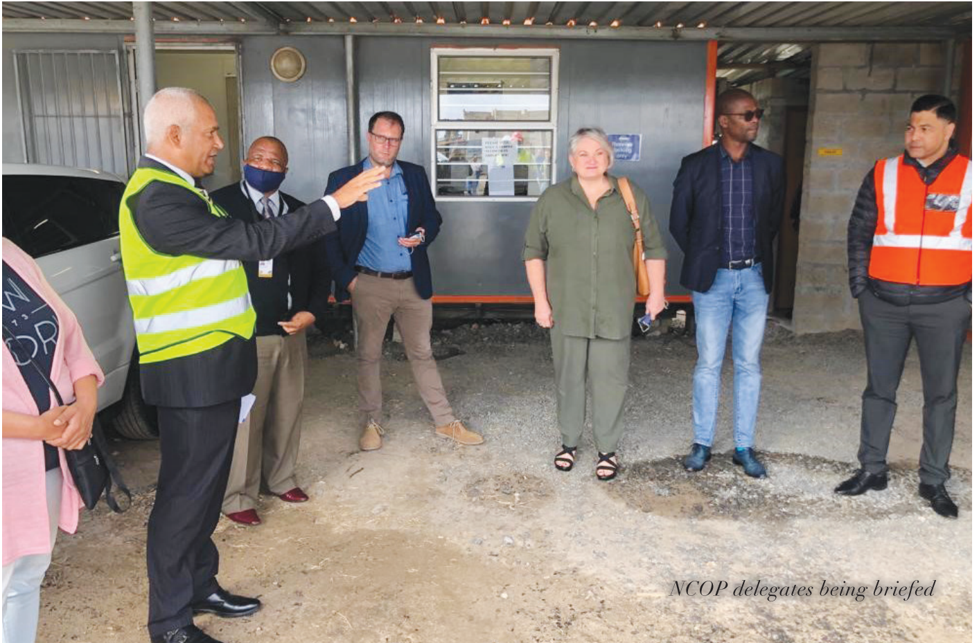
NCOP delegates being briefed

milestones of the project in relation to occupancy and the verification of housing registers to ensure that houses are handed over to rightful owners or beneficiaries." Its first phase, which is nearing completion, will accommodate 217 families. The project should be completed in July 2022.