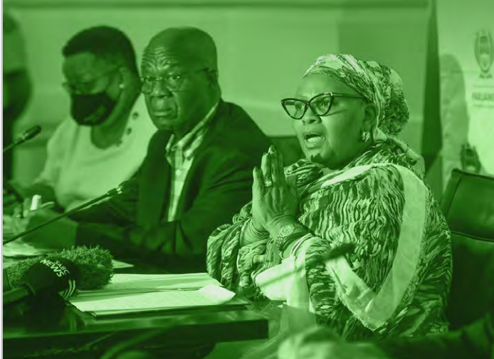
Produced by the Public Education Office, Core Business Support Division | Parliament of the Republic of South Africa PO Box 15, Cape Town, 8000 | Tel: 021 403 3341 | www.parliament.gov.za

For more information on how to get involved and participate in YOUR parliament please visit our website parliament.gov.za or request printed copies from info@parliament.gov.za