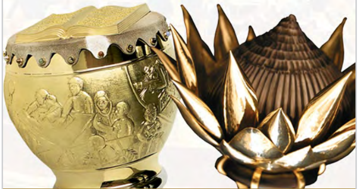
Produced by the Public Education Office, Core Business Support Division | Parliament of the Republic of South Africa PO Box 15, Cape Town, 8000 | Tel: 021 403 3341 | www.parliament.gov.za

It grants government (Executive) an opportunity to account to Parliament and the South African public. It is also about celebrating our nation and nation-building.