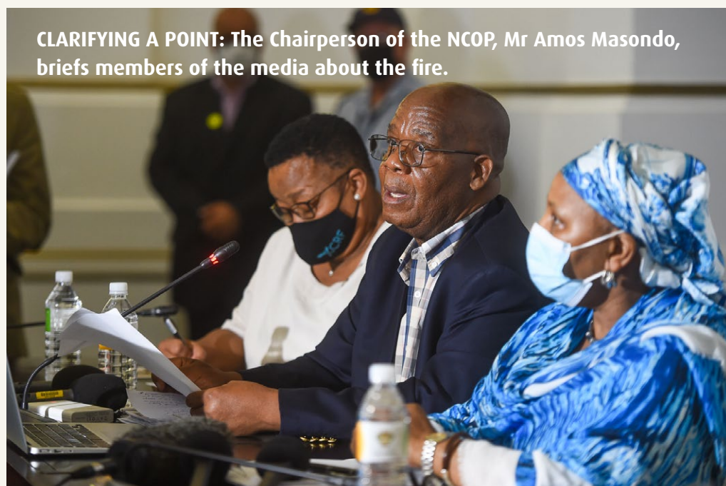
CLARIFYING A POINT: The Chairperson of the NCOP, Mr Amos Masondo, briefs members of the media about the fire.

Parliament's Presiding Officers also thanked President Cyril Ramaphosa and his ministers, Mr Mondli Gungubele, Ms De Lille, Deputy Minister Mr Zizi Kodwa, Members of Parliament and parliamentary officials who visited the scene to assess the damage and to offer support to emergency services personnel.