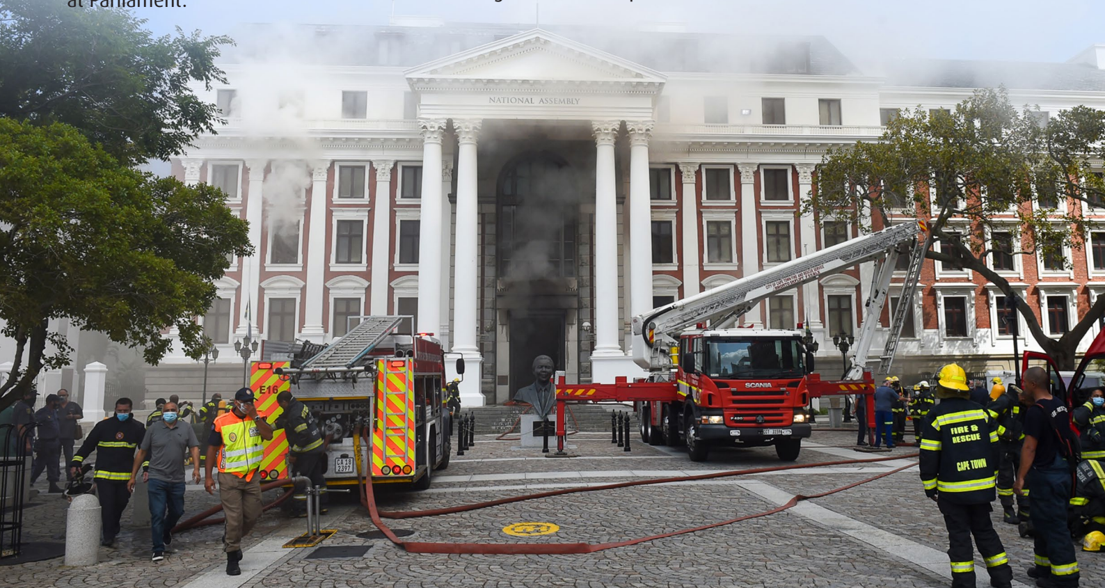
NATIONAL LEGISLATURE ON FIRE: The fire destroyed the building housing the National Assembly.

buildings of the Parliamentary precinct, and its aftermath. We are indeed devastated and deeply saddened. We are pained by the damage to the Old Assembly Chamber and building, the National Assembly Chamber, and critical offices of Parliament, which are a national key point and the legislative seat of our country, whose value is beyond any measure. This democratic institution has a deep history which represents unparalleled heritage treasures for our country and a source of social unity and cohesion required in our nation-building programme.”