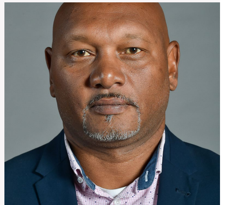
Mr Shaun August

The Portfolio Committee on Public Works and Infrastructure was briefed recently by a Member of the National Assembly (NA), Mr Shaun August, and the Department of Public Works and Infrastructure, on progress regarding a petition submitted to the Speaker of the National Assembly (NA) in November 2020. The petition called for the department to initiate a policy review that will look into developing a consistent system across municipalities, provincial governments and national government on how the Expanded Public Works Programme (EPWP) employs job seekers, writes Abel Mputing.