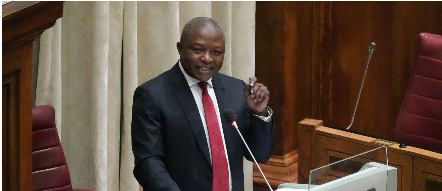
Mr David Mabuza, Deputy President