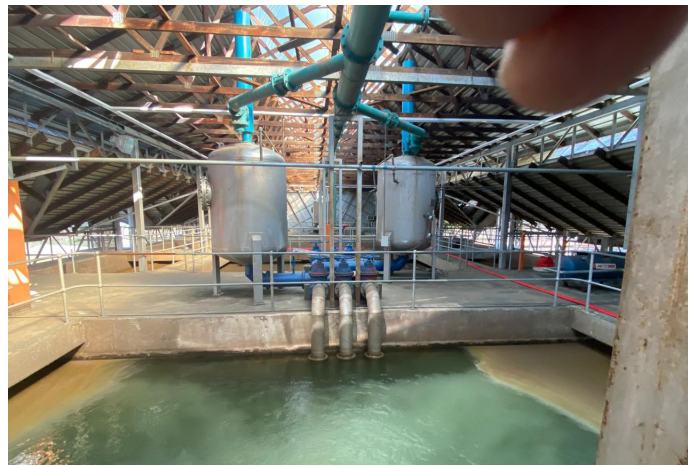
Madibeng Water Treatment Plant

The delegation has resolved to prioritise the two municipalities and to propose that the NCOP together with the Gauteng Legislature visit the two municipalities in an effort to finding lasting solutions to existing challenges. 🇿🇦