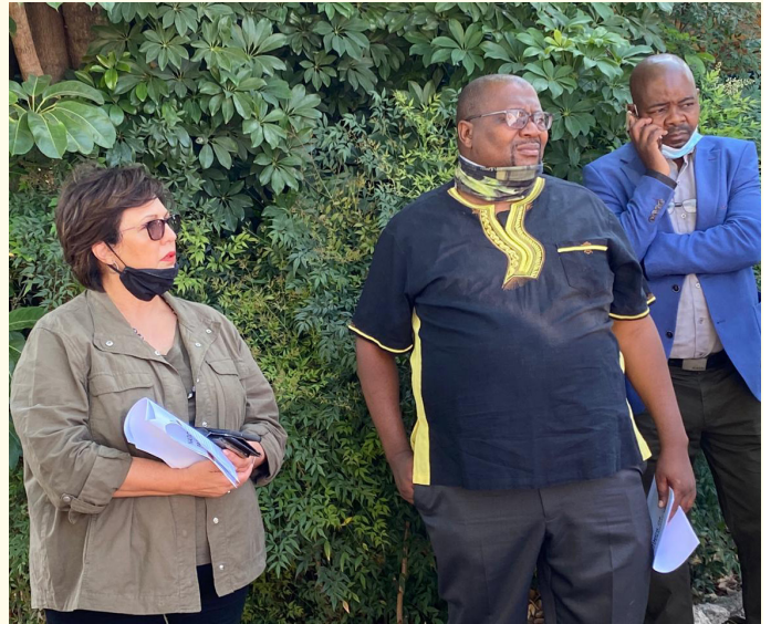
North West delegation visits Madibeng Water Treatment Plant

The delegation also received presentations from local municipalities, including Naledi Local Municipality, Dr Ruth Mompoti District Municipality, Maquassi Hills Local Municipality, from Dr Kenneth Kaunda District Municipality, Mahikeng Local Municipality, and the Ngaka Modiri Molema District Municipality. 🇿🇦