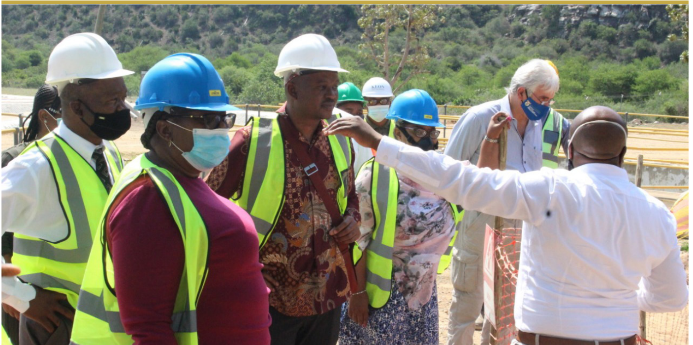
Project Manager briefs the Eastern Cape delegation.