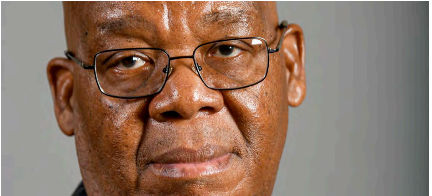
Mr Amos Masondo - NCOP Chairperson