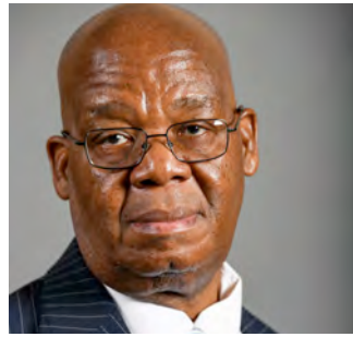
Mr Amos Masondo – Chairperson - NCOP