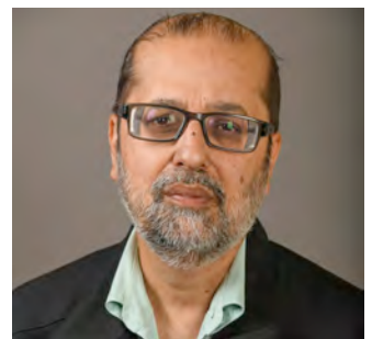
Mr Yunus Carrim