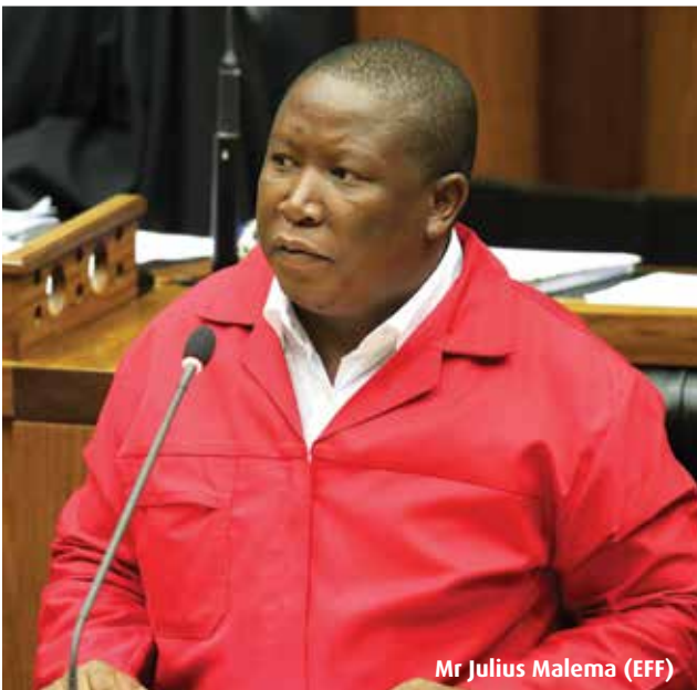
Mr Julius Malema (EFF)