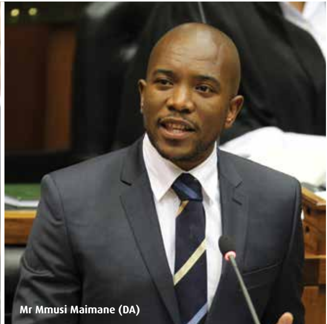
Mr Mmusi Maimane (DA)