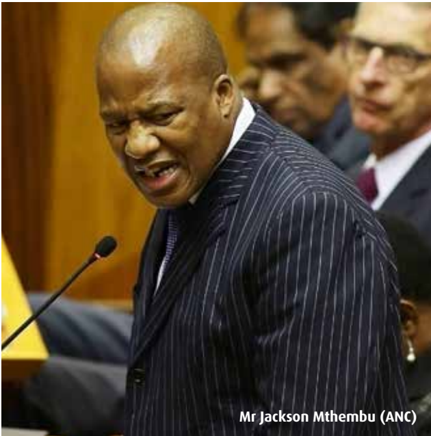
Mr Jackson Mthembu (ANC)