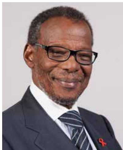
Prince Mangosuthu Buthelezi (IFP)

Furthermore, the unbundling of Eskom is synonymous with privatisation for the EFF. "An attempt to privatise it will never be accepted and you must rest assured, Mr President, that if you are not going to give an assurance that you will relook into this Eskom matter, we will waste no time and we will go to the picket lines and defend this strategic asset of our people."