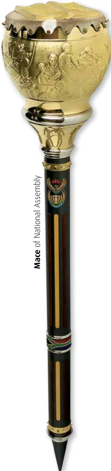
Mace of National Assembly

PARLIAMENT OF THE REPUBLIC OF SOUTH AFRICA