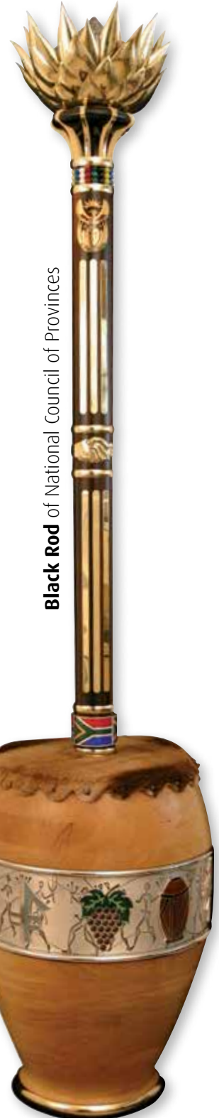
Black Rod of National Council of Provinces