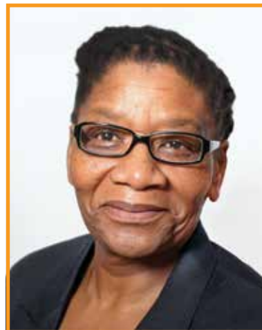
CHAIRPERSON OF THE NATIONAL COUNCIL OF PROVINCES: Ms Thandi Modise