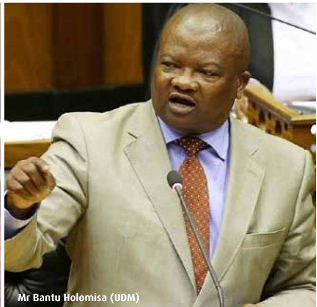
Mr Bantu Holomisa (UDM)