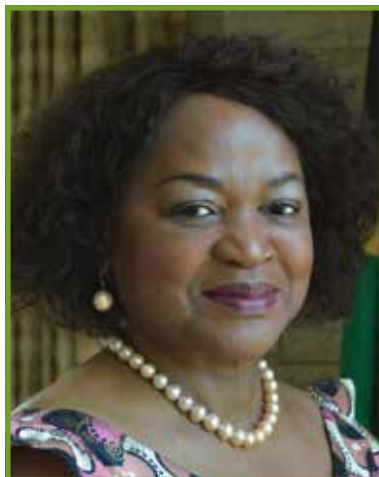
SPEAKER OF THE NATIONAL ASSEMBLY: Ms Baleka Mbete