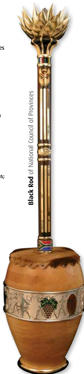
Black Rod of National Council of Provinces