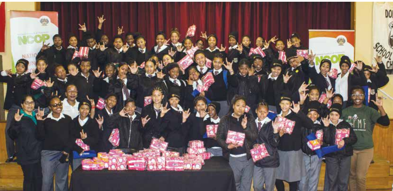
BRINGING DIGNITY: Students at the Dominican School for the Deaf in Cape Town celebrate Mandela Month with the National Council of Provinces.

In keeping with Mandela's selflessness, we should all strive to emulate what he set out to do, she told them. "We tend to forget that Mandela's life-long project was about non-racialism, non-sexism and the recognition and protection of every citizen. He stood for our rights, whether we are hard of hearing or not, have mental challenges or not, he reminded us that we are all South Africans and we must be proud of ourselves." 🇿🇦