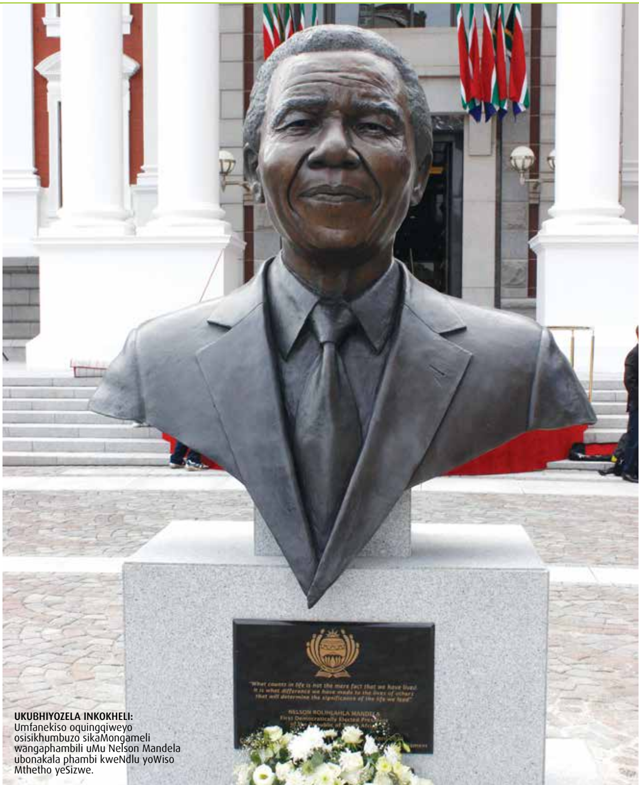
UKUBHIYOZELA INKOKHELI: Umfanekiso oqingqiweyo osisikhumbuzo sikaMongameli wangaphambili uMu Nelson Mandela ubonakala phambi kweNdlu yoWiso Mthetho yeSizwe.