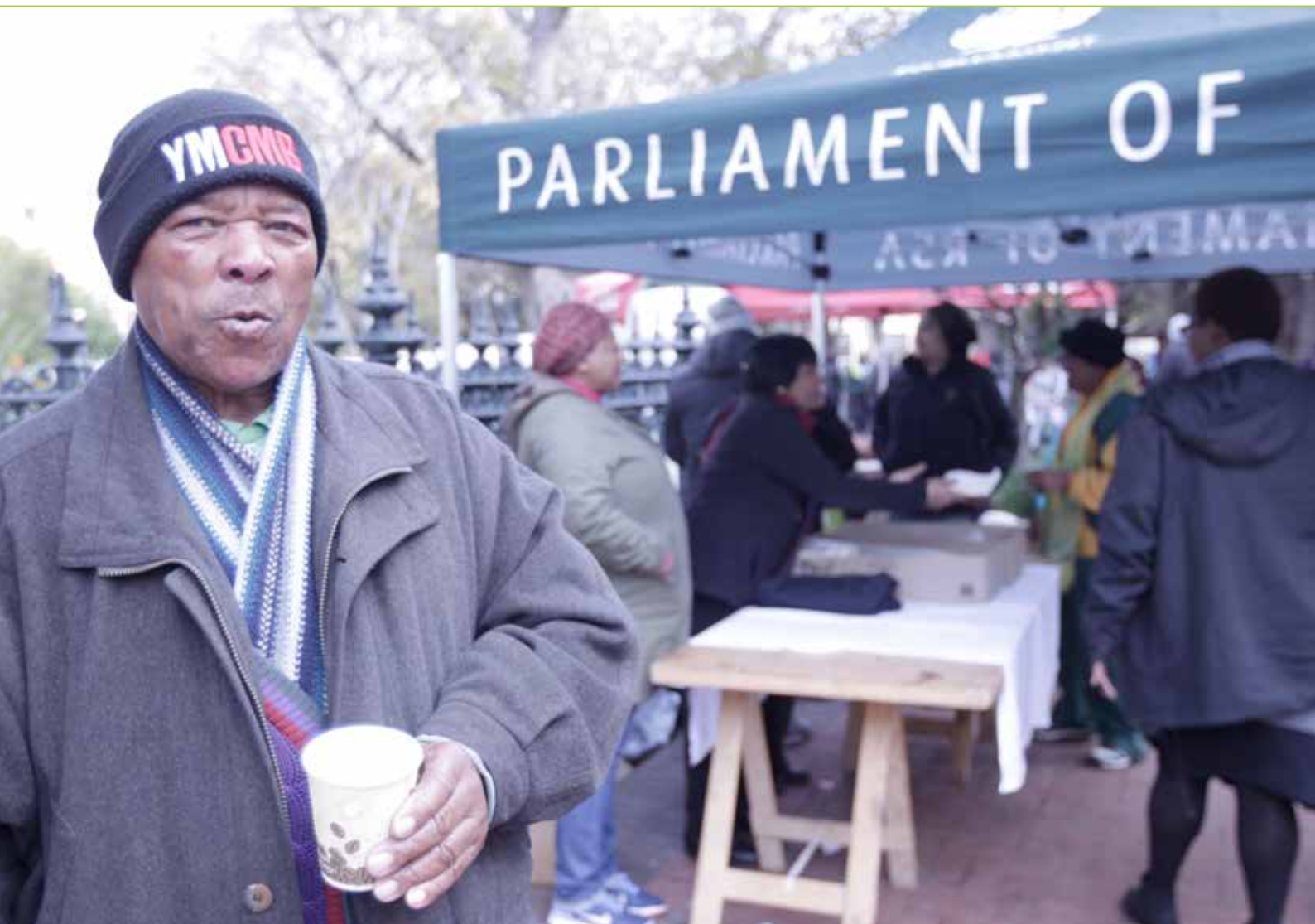
Parliament celebrated Mandela Month by providing soup people passing by the parliamentary precinct in Cape Town.