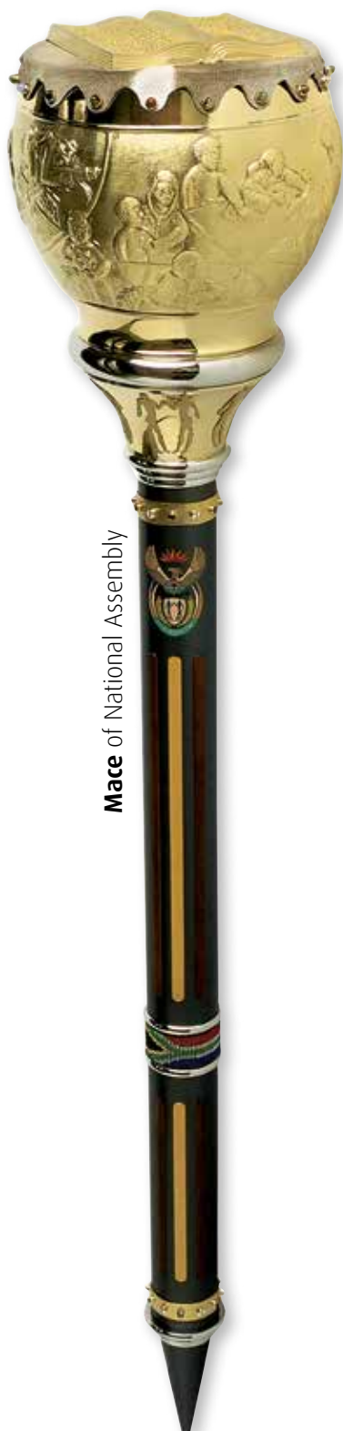
Mace of National Assembly