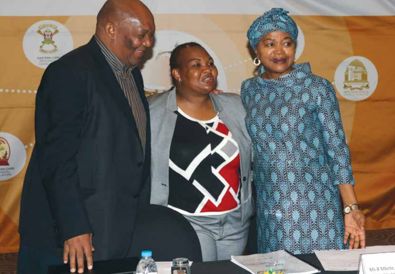
STRONGER TOGETHER: Speaker Ms Baleka Mbete (right), Deputy Speaker Mr Lechesa Tsenoli (left) with the Speaker of Limpopo, Ms Polly Boshielo.