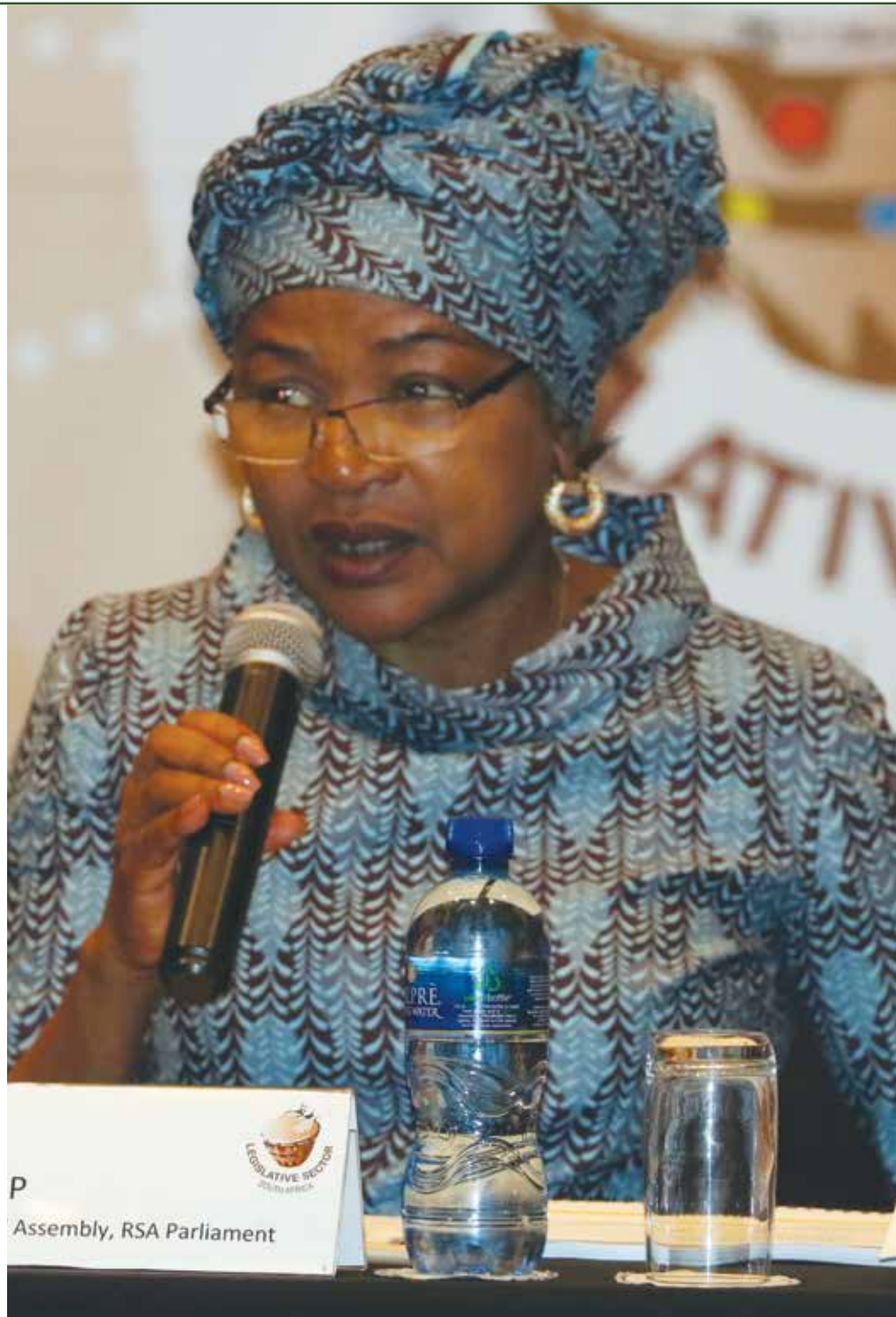
MAKING A POINT: The Speaker of the National Assembly, Ms Baleka Mbete.

At the Speakers' Forum, she raised a concern about what she called the