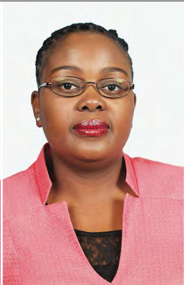
TELECOMMUNICATIONS AND POSTAL SERVICES CHAIRPERSON: Ms Mmamoloko Kubayi.