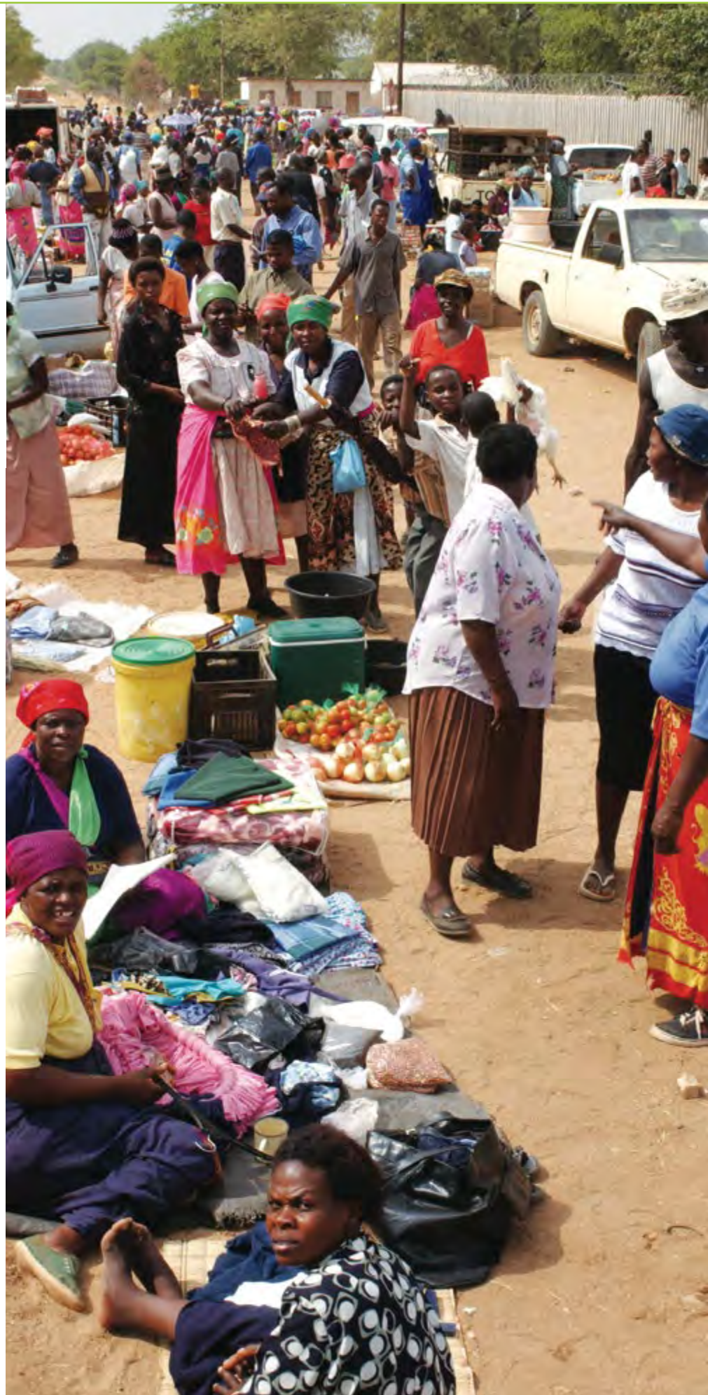
GENDER EQUALITY: The CGE has a duty to promote, attain and protect gender equality at all levels of South African society.

During April and May 2014, the CGE undertook two critical projects – hosting a National Gender Summit and monitoring the May 2014 general elections. The gender summit was held from 9 to 11 April 2014 in Benoni, Gauteng, and was convened by the Commission, in partnership with United Nations (UN) Women, the UN Population Fund, the UN Development Programme, Oxfam, the national