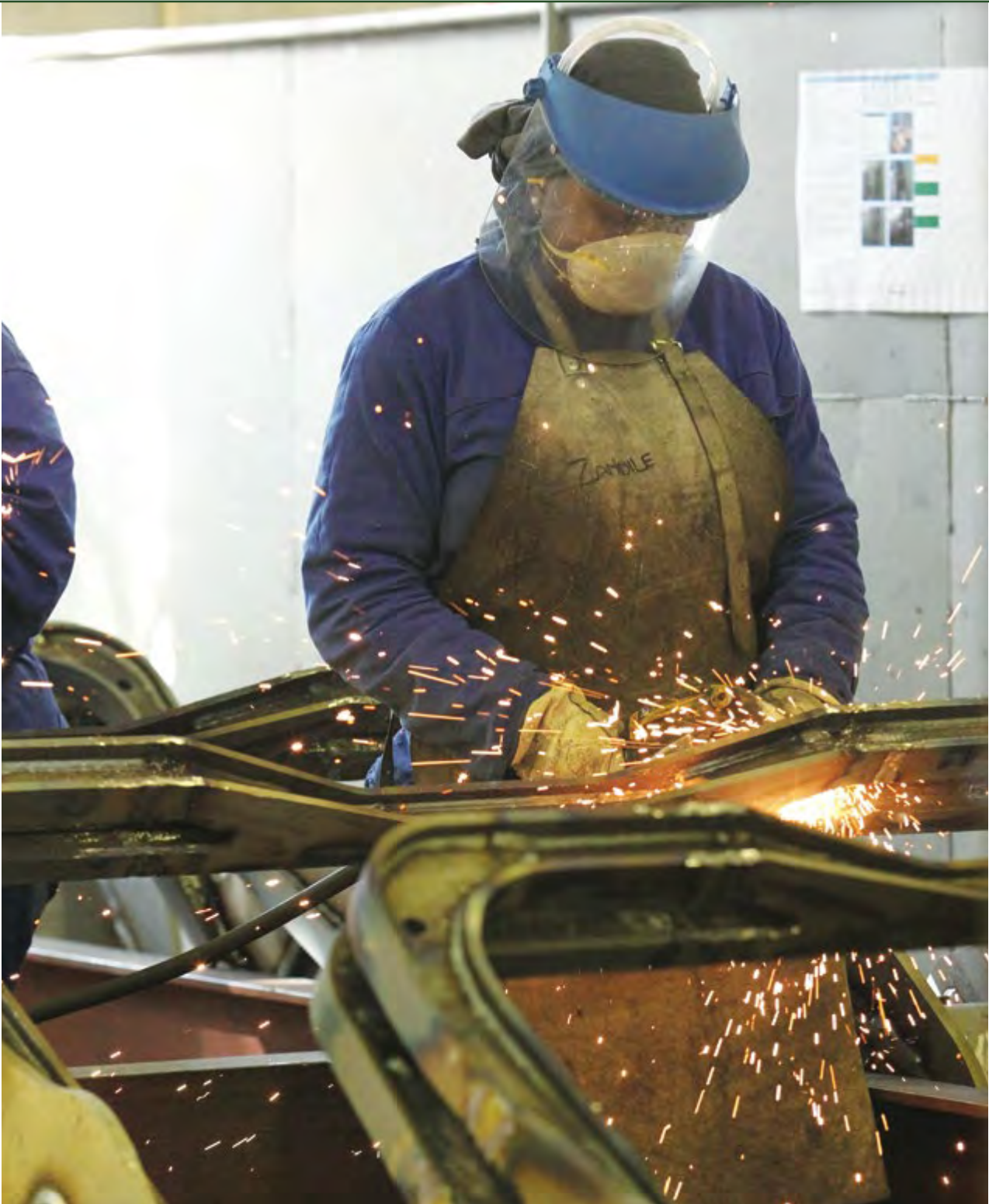
DECENT WORK: Reaching our economic growth targets depends on developing the skills of the country's workers.