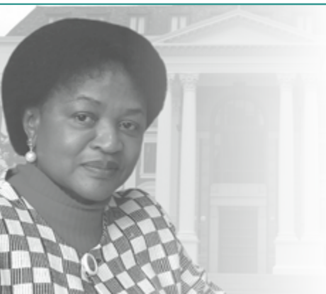
Speaker of the National Assembly, Ms Baleka Mbete