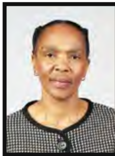
PC on Arts and Culture Ms XS Tom 021 403