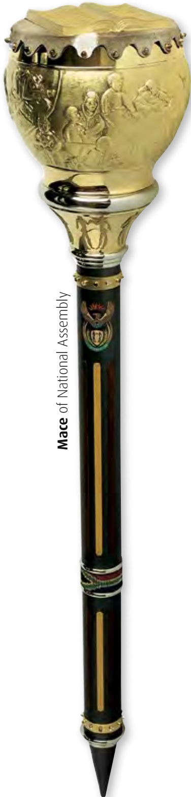
Mace of National Assembly

PARLIAMENT OF THE REPUBLIC OF SOUTH AFRICA