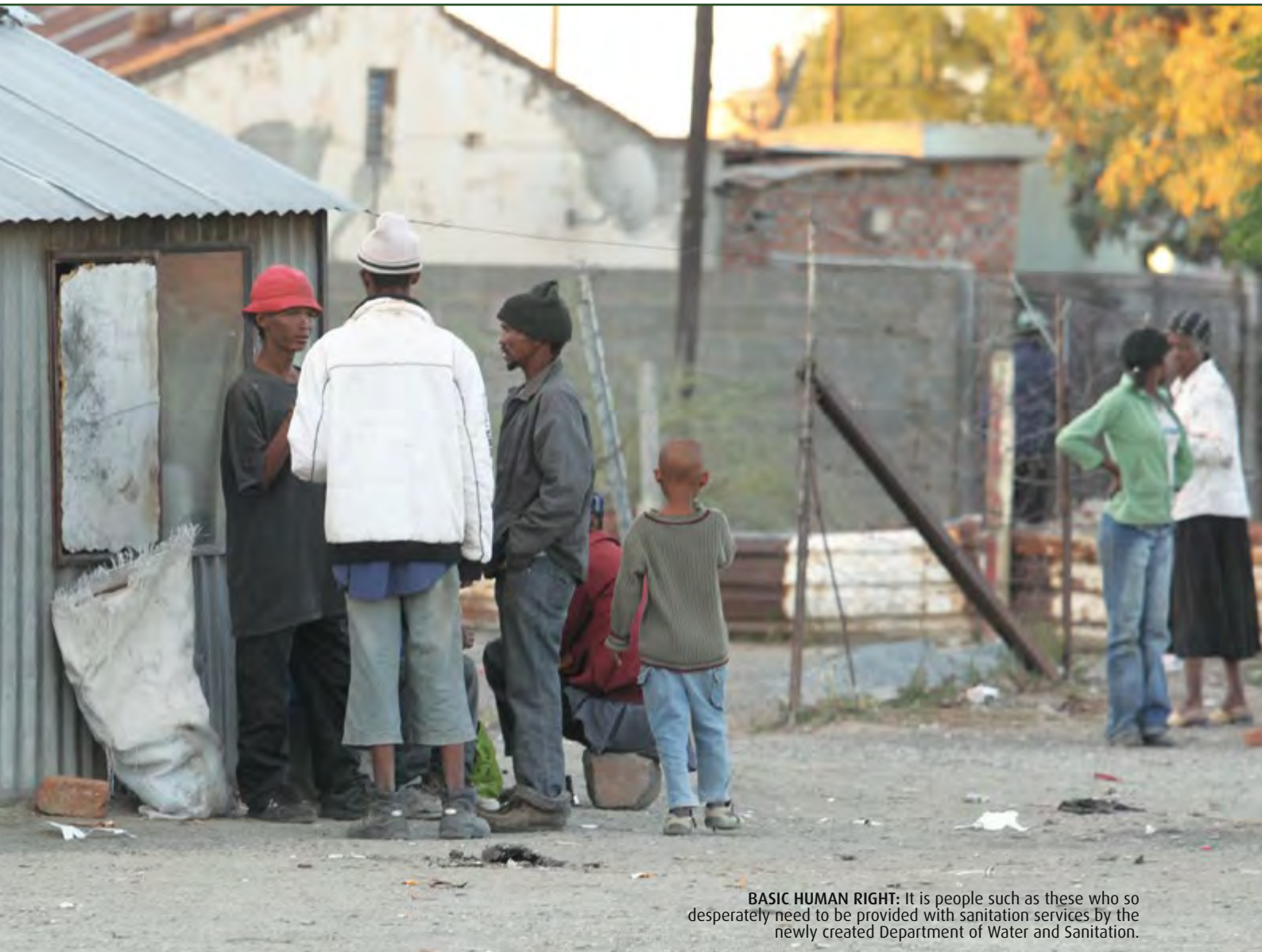
BASIC HUMAN RIGHT: It is people such as these who so desperately need to be provided with sanitation services by the newly created Department of Water and Sanitation.