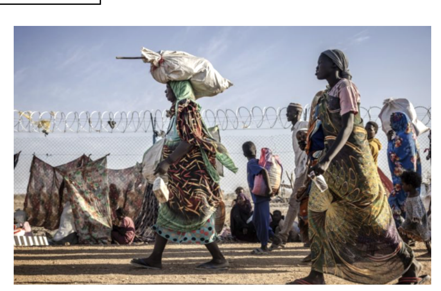
Sudanese refugees and South Sudanese returnees who have fled from the war in Sudan carry their belongings while arriving at a Transit Centre

Since last April, his team has documented 60 incidents of conflict-