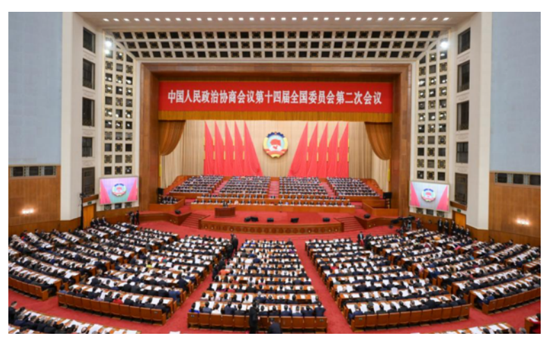
The opening meeting of the second session of the 14th National Committee of the Chinese People's Political Consultative Conference (CPPCC) was held at the Great Hall of the People in Beijing, China, March 4, 2024.

Over the year, CPPCC members have been active in submitting proposals and much of their concerns have been addressed in China's policies. A total of 5,621 proposals have been filed.