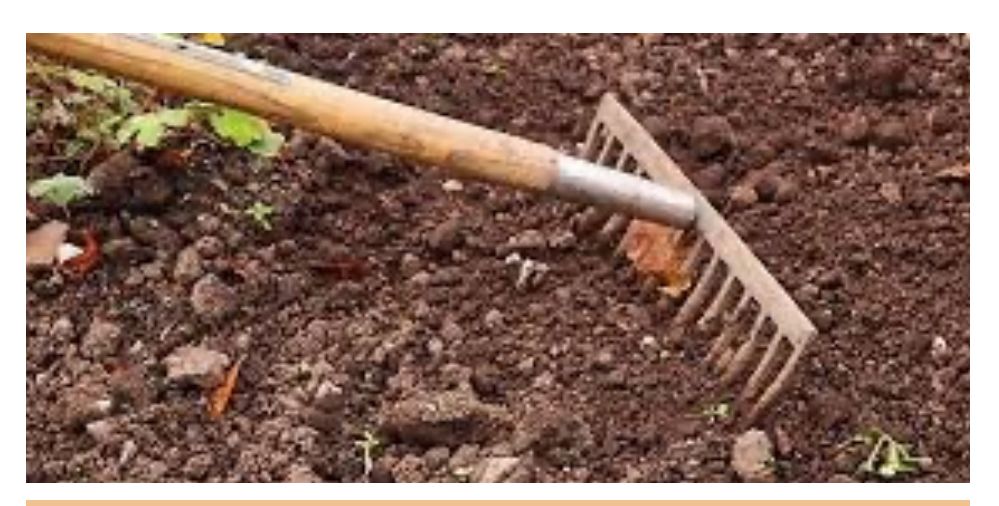
Tokiso ya sebaka sa seratswana e bohlokwa pele o jala. Hoba mobu o phetholwe, o lokelwa ho batalatswa ka haraka e le karolo ya tokisetso ya tjalo.

Na mobu o letsopa kapa o lehlabathe? Na mobu ke o nang le bodila (acidic) kapa o se nang bodila (alkaline)? Na mobu o hloka dijo kapa o tletse phepo? Ha eba o batla ho ntlafatsa katleho seratswana sa hao ka hohlehohle, nka nako ho tseba mofuta wa mobu o seratswaneng sa hao. Ho bohlokwa ho tseba hore mobu o