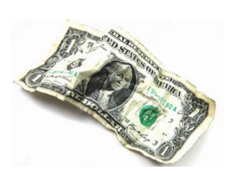
Kgonahalo ya ho putlama ha dollar ya Amerika ho ka susumetsa BRICS ho fumana mokgwa o motjha wa phaphanyetsano kgwebisanong.

Ho boetswe ha fihlelwa qeto e kgolo ya ho amohelwa ha ditho tse ntjha tsa BRICS e leng dinaha tse 6 tse latelang: Argentina, Egypt, Ethiopia, Iran, Saudi Arabia mmoho le United Arab Emirates. Botho ba di naha tsena bo tla kena tshebetsong ka ho phethahala ka Pherekgong isao (2024). Ho sa na le dinaha tse ding tse ngata tse