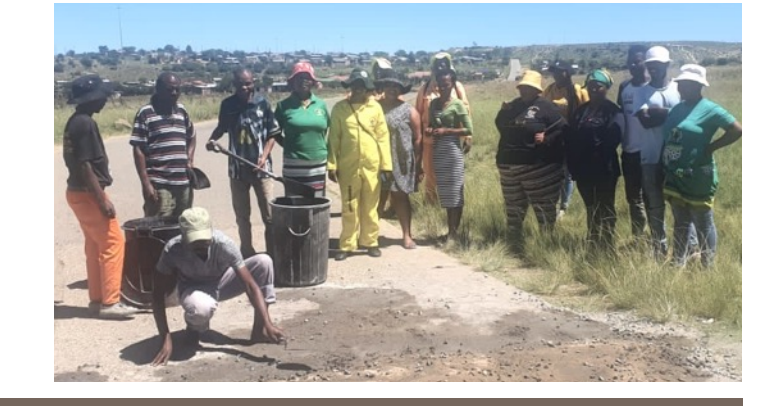
Kgweheletso ya tsoseletso ya Letsema; bopaki ke ho bonahala ha ditho tsa ANC le baahi mererong ya tlhwekiso 🛛 ya tikoloho le tokiso ya mebila