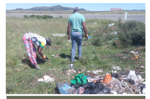
Ditho tsa ANC di eme ka maoto ho hlwekisa dibakeng tsa bodulo le tsa setjhaba esita le tikoloho ka kakaretso

"Takatso ya rona ke hore letsholo lena e be mosebetsi o tswellang ho ya ho ile hobane bohlweki re le setjhaba ke ntho eo re lokelang ho phela le yona ka dinako tsohle, kahoo, re rata hore letsholo lena le dule le le teng ka mehla." O rialo a kgothaletsa setihaba ho nka karolo matlafatsong le ho tswellisa pele letsholo lena.