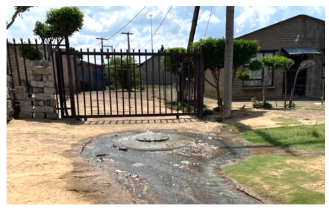
Poor maintenance. and broken infrastructure are frequent and great concern to many communities

The Red Saturdays and related activities will be rolled - out to different wards in the district going forward, and announcements will be made as to where these will be happening."