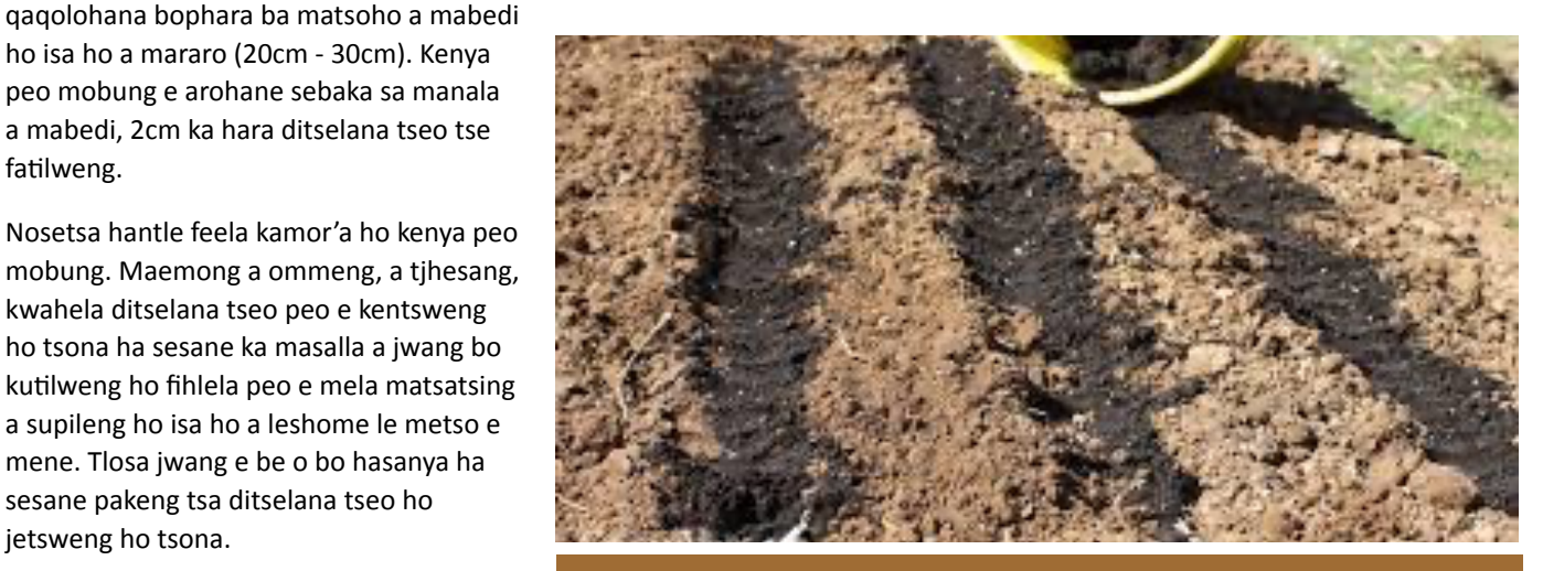
Qaqolohanya mela bophara ba diatla tse pedi ho isa ho tse tharo. Kwahela ka oodiswa ha sesane ka mor'a hore o kenye peo ya dihwete mobung.

Ha o jala dihwete le rapa ho thusa hore bokahodimo ba mobu bo se be thata, mme ho bontsha hantle moo peo ya dihwete e kentsweng teng. Ho sebedisa sebaka hantle le ho fokotsa lehola - jala rapa/mustard tseo peo ya tsona e melang kapele pakeng tsa mela ya dihwete. Rapa e tla mela kapele hoo e reng ha dihwete di qala ho hola, yona e tla be e se e loketse ho kotulwa. Bakeng