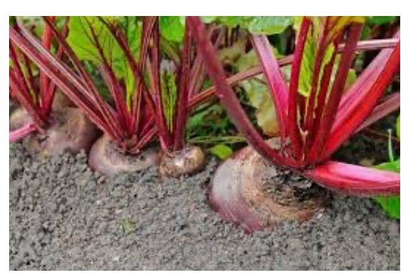
Tlhahiso e ntle ya beetroots e hloka mobu o phepo e ntle mme phetse hantle.

amoheleha. Beeetroot e k eke ya amohela mobu o batlang o ba bodila (oo pH ya ona e leng ka tlase ho 6.0). Ho etsa hore beetroots e mele hantle, mobu o lokela ho hloka majwe le ditshita tse ding. Ho bohlokwa ho isa mobu ho