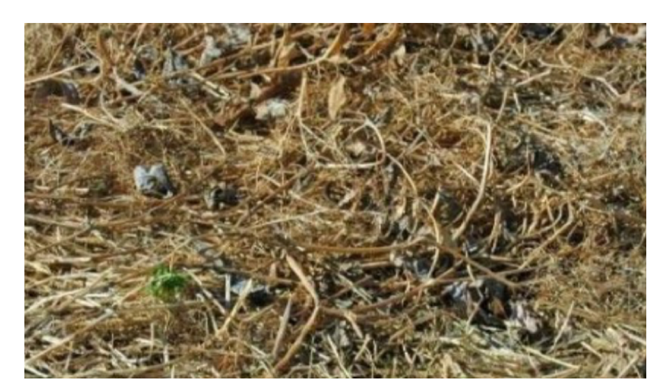
Dierekisi tse shweleng di sebediswa ho boloka mongobo le ho thibela lehola.

Kgohedi ya dikokwanyana tse kang dinotshi le bo-maleshwane . Dijalo tse kgurumetsang tse ding di nehelana ka mehlodi ya bohlokwa jwaloka lero le phoshwana ya peo le tshireletso maemong a boima a mariha ho dikokwanyana tse molemo,