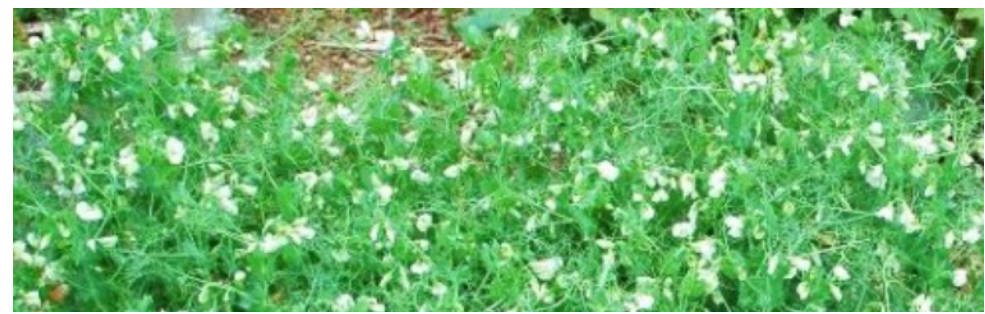
Dierekisi di sebedisitswe mona ho kwahela dijalo kapa meroho e meng.

Tshebediso ya tshimo kapa seratswana ho ka qeta dijo tsa mobu mme tsa dumella kgonahalo ya mafu le lehola ho ata. Dijalo tse kgurumetsang tse ding di ka fokotsa mathata ana. Mme tsa boela tsa fokotsa tshebediso ya meriana e