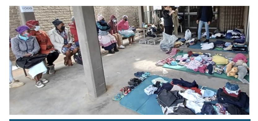
Karolo ya baahi ba tlileng ho amohela diaparo le dijo

SASKO le Metro Fruit & Veg Botshabelo e bile tse ding tsa dikhampani tse ka sehlohong tse ileng tsa nka karolo ka