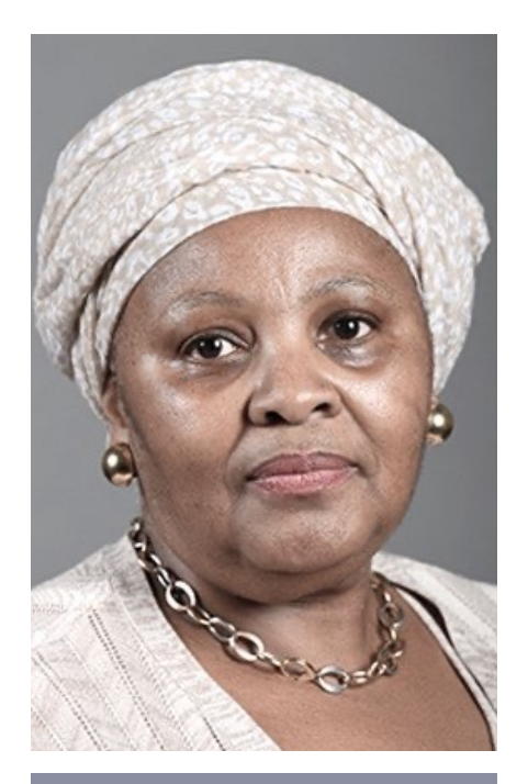
Speaker of the National Assembly, Ms Nosiviwe Mapisa-Nqakula,

She urged the P20 parliamentarians to multiply their efforts to achieve the