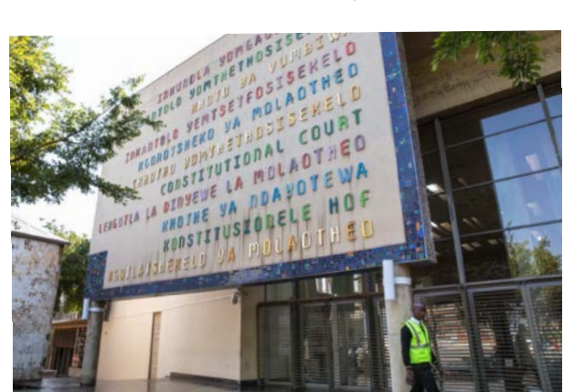
The Constitutional Court has ruled that sections of the Copyright Act are unconstitutional and Parliament has 24 months to fix it.

Amendments to the Act have been in the offing for some 12 years.