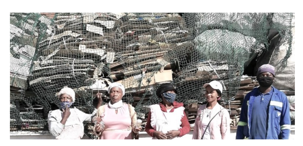
Baahi bana ba motlotlo ka mosebetsi oo ba o etsang ka hara motse wa Botshabelo. Ho phutha matlakala le ho a sebetsa ka tshwanelo ho ka thusa haholo ho fokotsa legeme la mesebetsi le jeleng setsi.

"Meqomo ya matlakala ya boemo bo phahameng e lokelwa ho hlongwa ka mokgwa eo e ke keng ya ntshwa le ho senngwa ha bonolo." O rialo a supa hore le ha ho na le methwaela ya megomo ena, ke megomo e se nang mothamo o lekaneng mme e meng e beilwe ka tsela e sa kgothaletseng batho ho lahlela ho