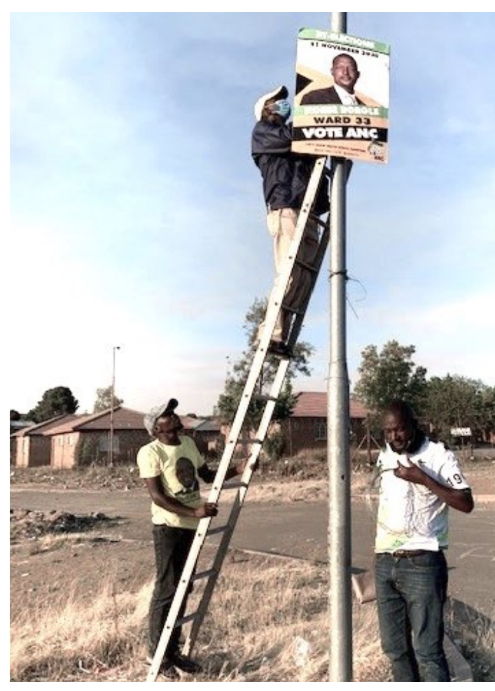
Ba phatlalatsa mabitso le ditshwantsho tsa bakgethwa ho ngoka bakgethi