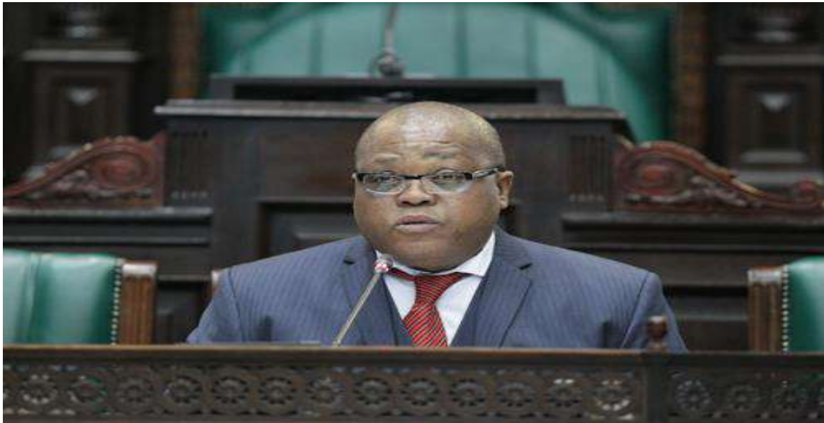
The Deputy Chairperson of the NCOP, Hon RJ Tau Chairing a session of the 2015 Youth Roundtable Discussion

facing South Africa's youth today. The 2015 Youth Roundtable discussion, was convened under the theme: "Africa Rising: Creating a Capable State through Youth Empowerment by 2030".