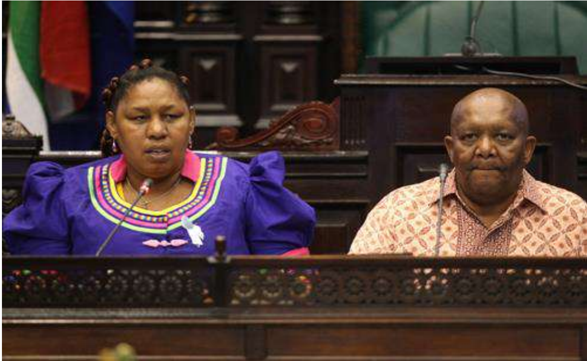
Deputy Speaker of the National Assembly, Hon LS Tsenoli and Deputy Minister for Social Development, Hon H Bogopane-Zulu, co-chairing the Inaugural Men's Parliament

Given the current statistics of on Gender Based Violence (GBV), it is imperative that Parliament formulates and solidifies partnerships with civil society groups across the board, in order to find strategic solutions one of society's greatest current challenges as they relate to the prevalence of GBV and HIV.