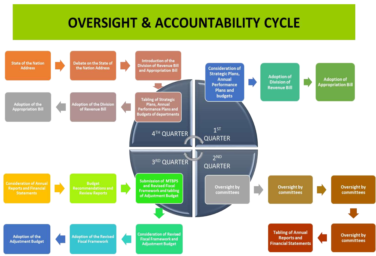
Figure 1: Implementation of Oversight & Accountability Model – the budget cycle

In general, Committee oversight processes follow the annual cycle of the Oversight and Accountability Model (Figure 1). Every year committees review the departmental strategic plans, annual performance plans and departmental budgets. Parliament approves the budget, allocating funds to each institution of the state in accordance with the plans and strategies set out for that year. Committees continuously monitor expenditure and performance, through amongst others, the quarterly and annual reports of departments. Furthermore, Committees oversee progress in the implementation of government’s plans and strategies through issue-based committee engagements with Ministers, government officials and civil society organisations, where relevant. Ministries and departments are required to outline how their expenditures contribute towards the policy priorities Parliament has endorsed. A particular focus of the fifth Parliament was the scrutiny of departmental strategies, plans and budgets in relation to the policy priorities and key outcomes of the National Development Plan.