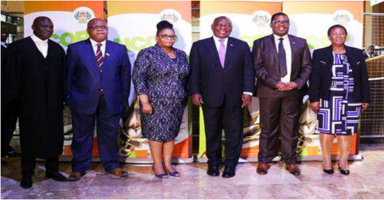
The 2018 Taking Parliament to the People visit to Gauteng province, marked the last TPTTP visit undertaken during the fifth Parliament

The NCOP Taking Parliament to the People Pre-Visit to Gauteng took place from 17 to 21 September 2018 and focused primarily on the impact of migration on service delivery on the various key sectors, through site visits and public meetings in the following municipalities: City of Johannesburg, City of Ekurhuleni, West Rand District Municipality and the City of Tshwane Metropolitan Municipality.