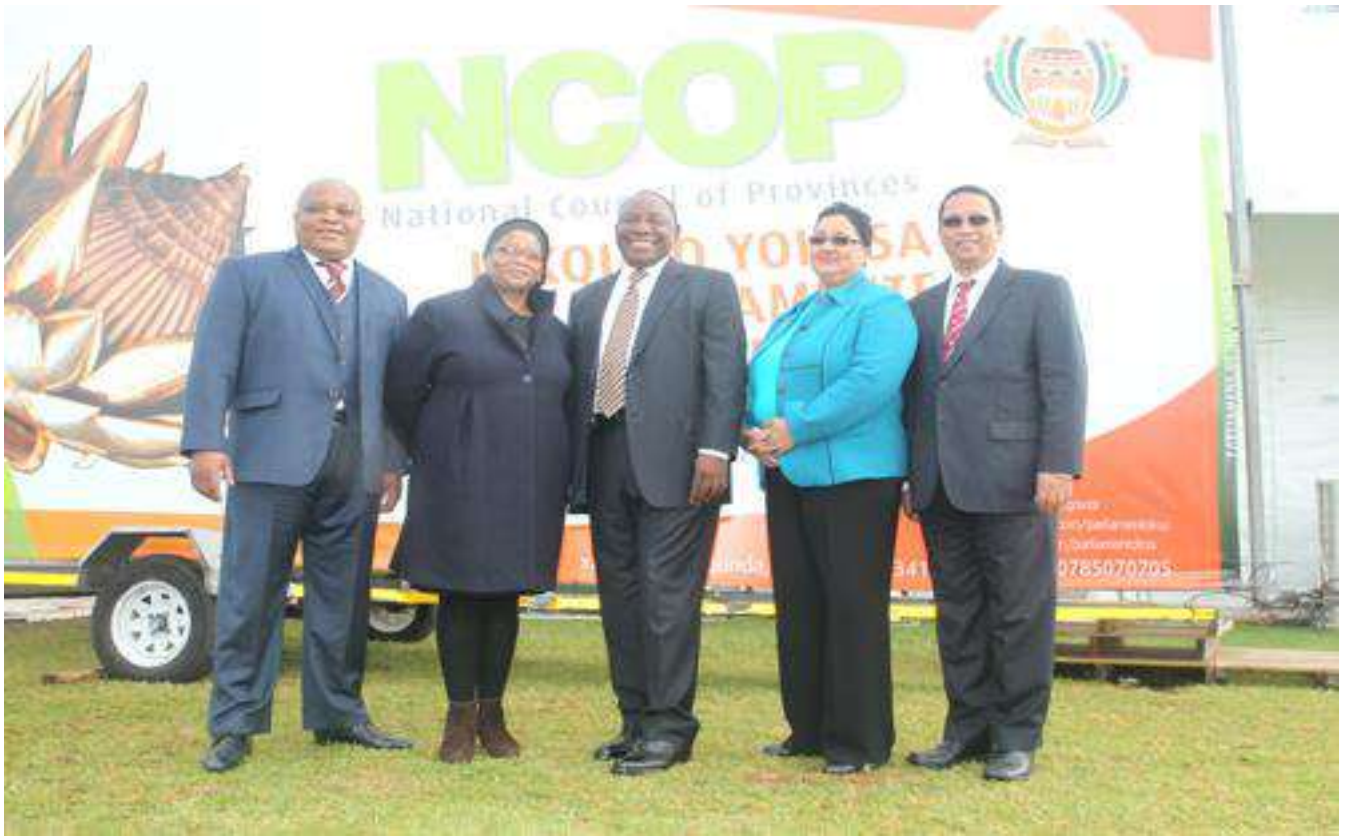
The state President of the RSA, Hon CM Ramaphosa, flanked by the Chairperson of the NCOP, Hon TR Modise, the Deputy Chairperson of the NCOP and the Western cape legislature leadership