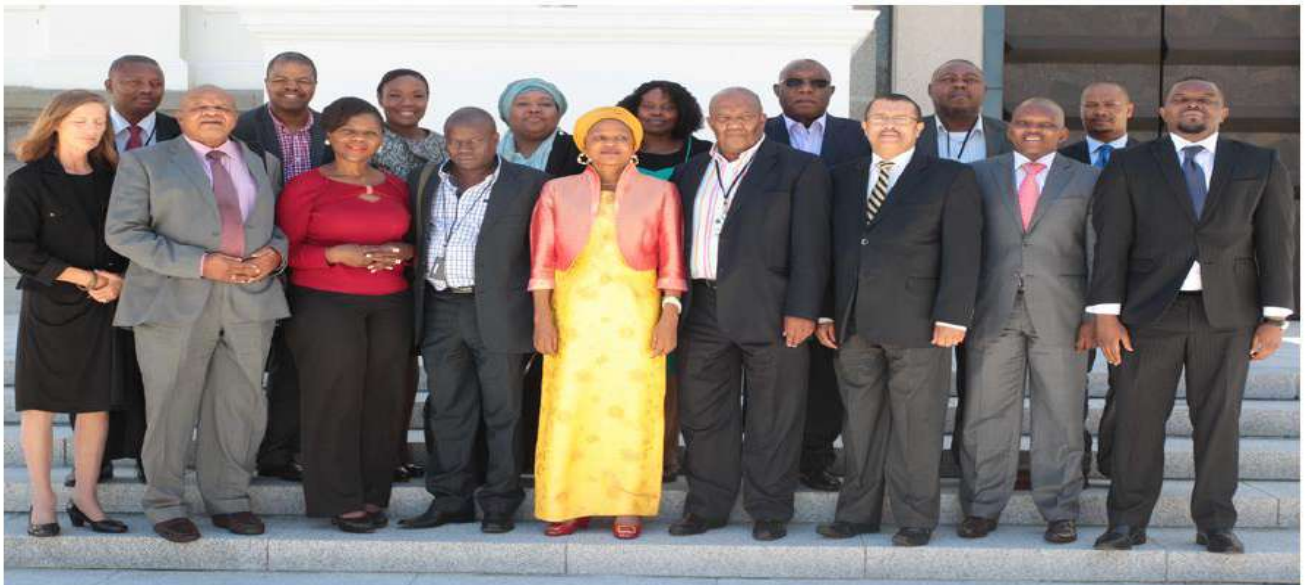
The Speaker of the National Assembly, the Deputy Speaker of the National Assembly and House Chairperson in the National Assembly, flanked by heads of Institutions Supporting Democracy