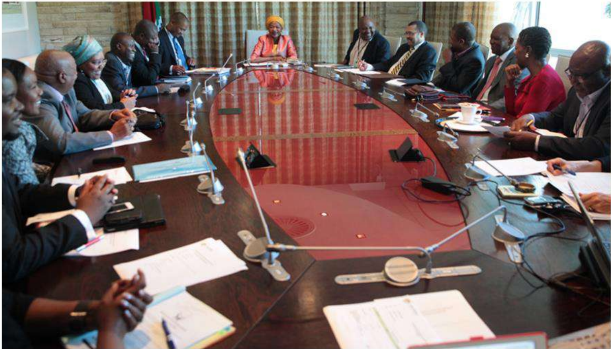
The Speaker of the National Assembly chairs a meeting between Presiding Officers of the National Assembly and heads of Institutions Supporting Democracy

Parliament established a Task Team including the ISD's and National Treasury. A report with recommendations was submitted to Parliament in June 2018 for further processing.