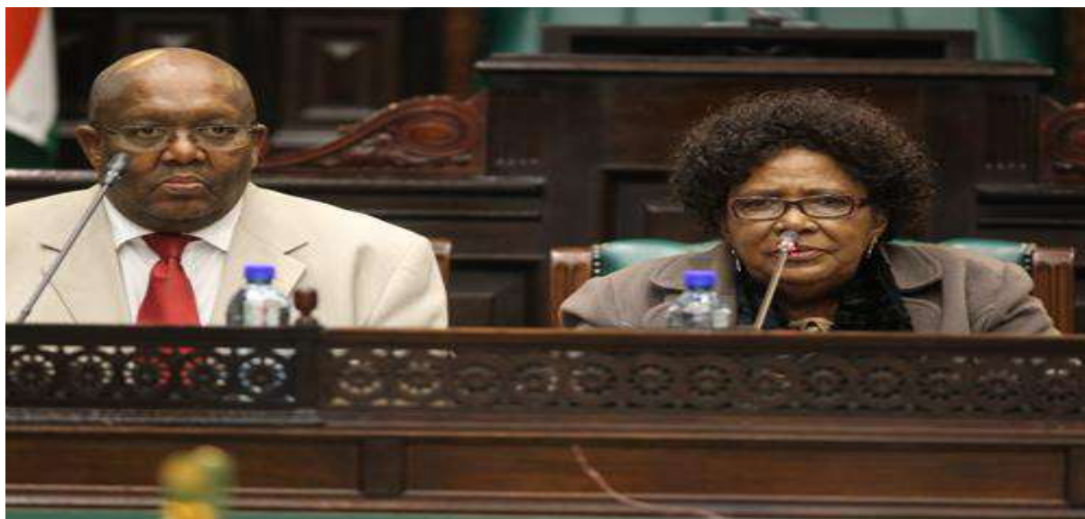
Deputy Speaker Hon SL Tsenoli and the Chairperson of the Women's Caucus, co-chairing the 2015 Women's Roundtable Discussion (Engendering the NDP)

The 2015 women's Roundtable Discussion was hosted under the theme: Accelerating Women's Empowerment and Development through Engendering the National Development Plan and Financing for Gender Equality.