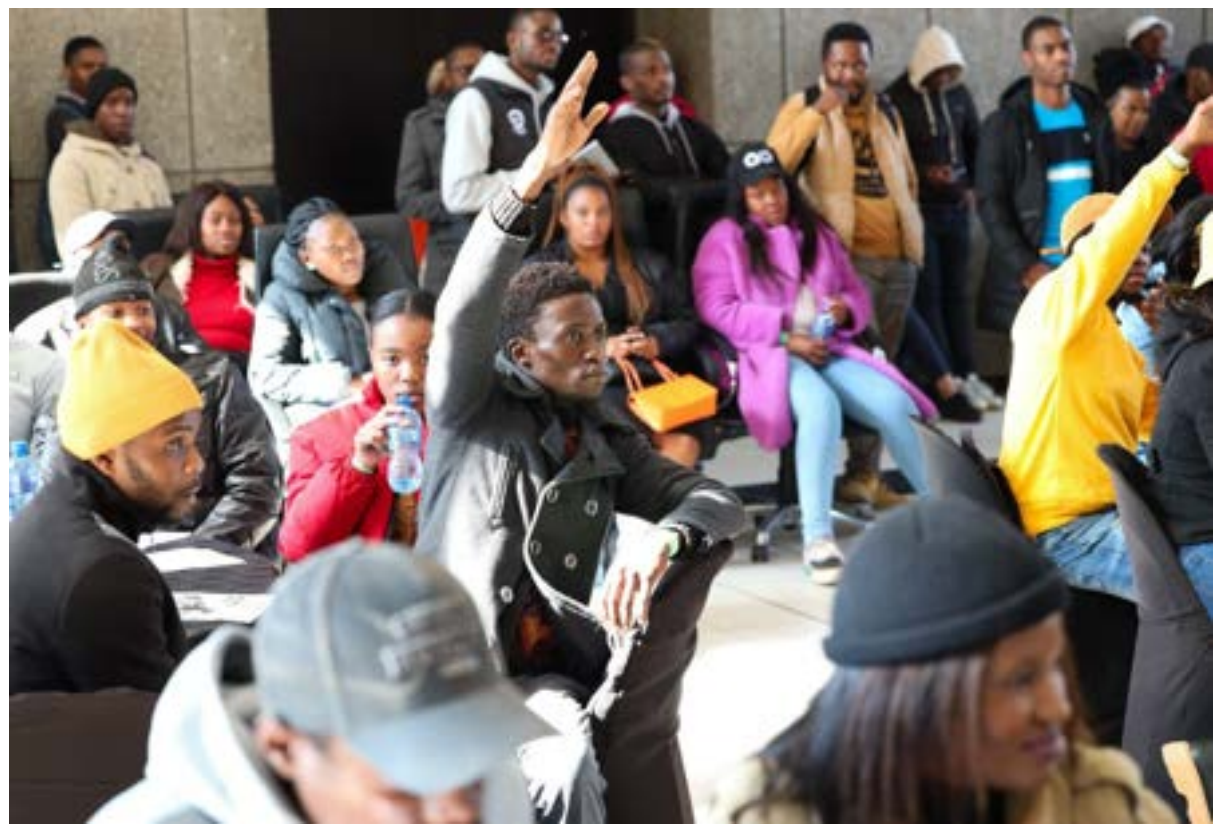
Youth representatives at a Youth Jobs Imbizo Summit at the Metro Centre in Johannesburg on 23 June 2023. The summit brought together business, young people and the government to discuss pressing issues affecting young people.

South Africa stands out as a beacon of participatory democracy, with few precedents worldwide of legislation being struck down due to failures in public engagement. We must recognise this unique position and continue to lead by example. The global trend towards disillusionment with traditional political processes calls for revitalising participatory democracy. Rather than sporadic consultations, continuous public engagement is key to rebuilding trust and empowerment.