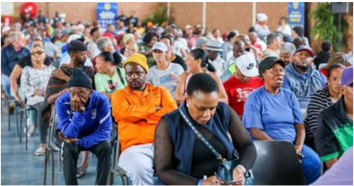
Westbury residents ask for time frames during the crime prevention ministerial imbizo at the Westbury Recreation Centre in Johannesburg on 7 March 2023. The imbizo aimed to give residents a platform to discuss and engage the police on crimes plaguing the community.