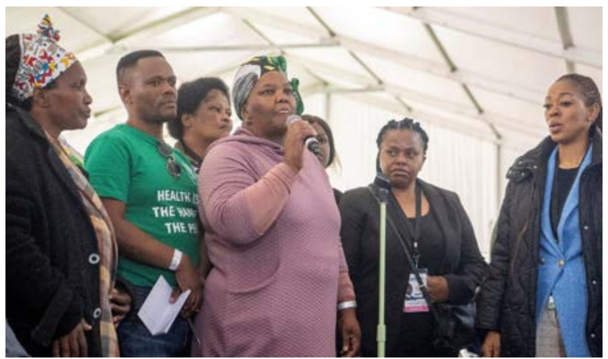
Paarl residents at a presidential imbizo held at the Dal Josaphat Sports Stadium on 19 May 2023, where they shared their unhappiness and grievances directly with the President.

In conclusion, the Doctors for Life case offers us valuable insights into the true essence of participatory democracy. As a living document, our Constitution demands more than just representative democracy; it envisions an active, engaged citizenry. We must embrace the principles of inclusivity, accountability and openness. By taking reasonable steps to involve the public, we strengthen our democracy and ensure a fair and just society. Let us seize this. DM