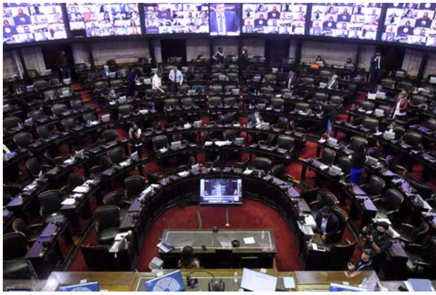
Argentina. The Chamber of Deputies swiftly moved to holding hybrid and virtual sessions when the COVID-19 pandemic struck. 2022.