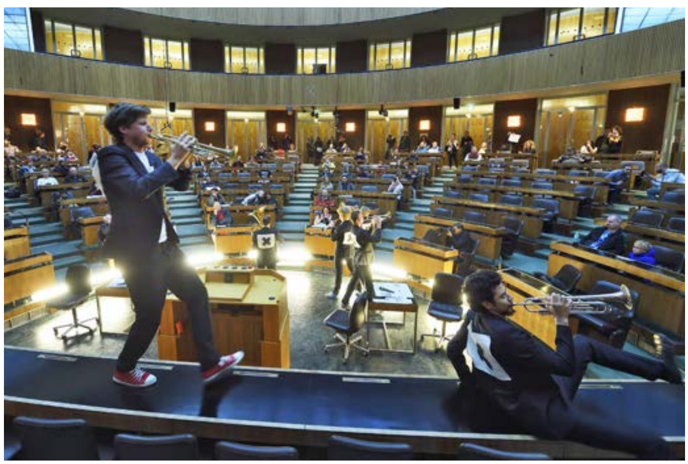
Austria. Art performance on the occasion of the Open House Day.