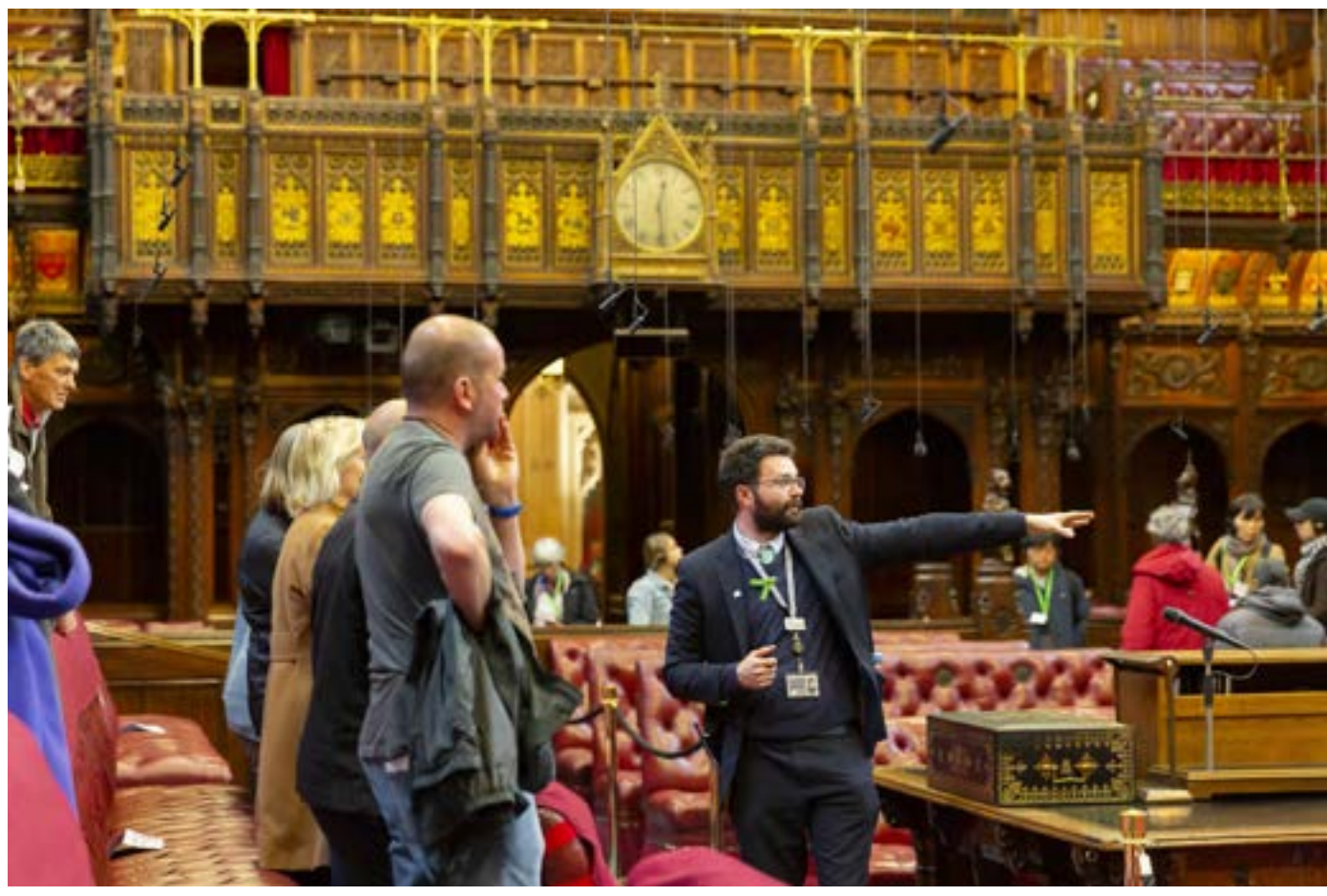
Guided tour at UK Parliament. Terms and conditions: This photo, and all related crops, are released under an Attribution 3.0 Unported (CC BY 3.0) licence.