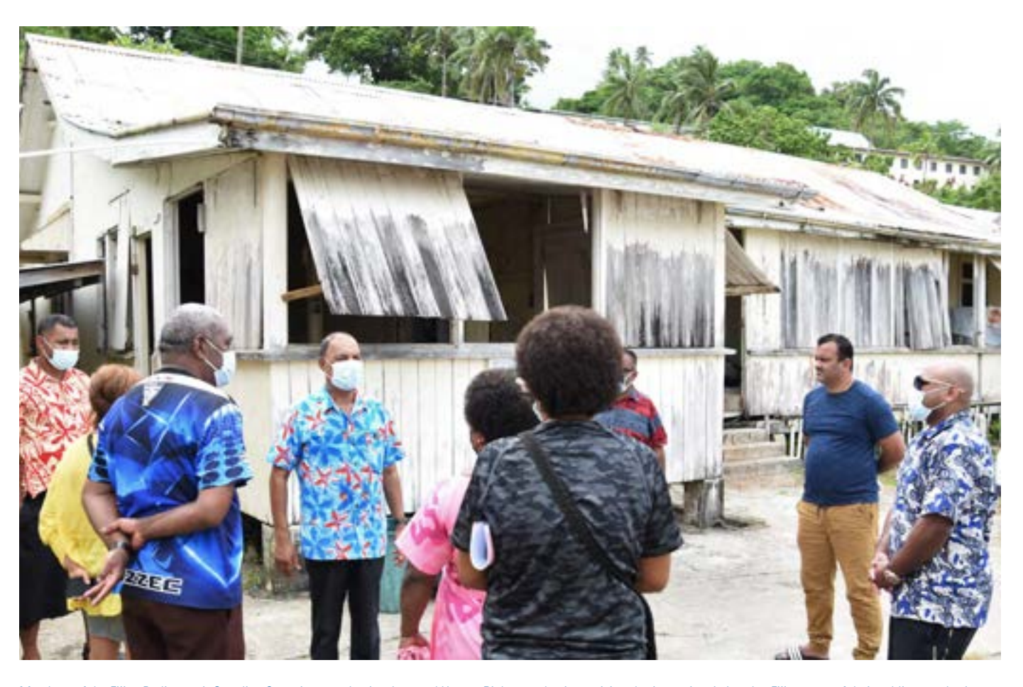
Members of the Fijian Parliament's Standing Committee on Justice, Law and Human Rights conducting a visit to heritage sites in Levuka, Fiji, as part of their public consultation on a heritage bill.