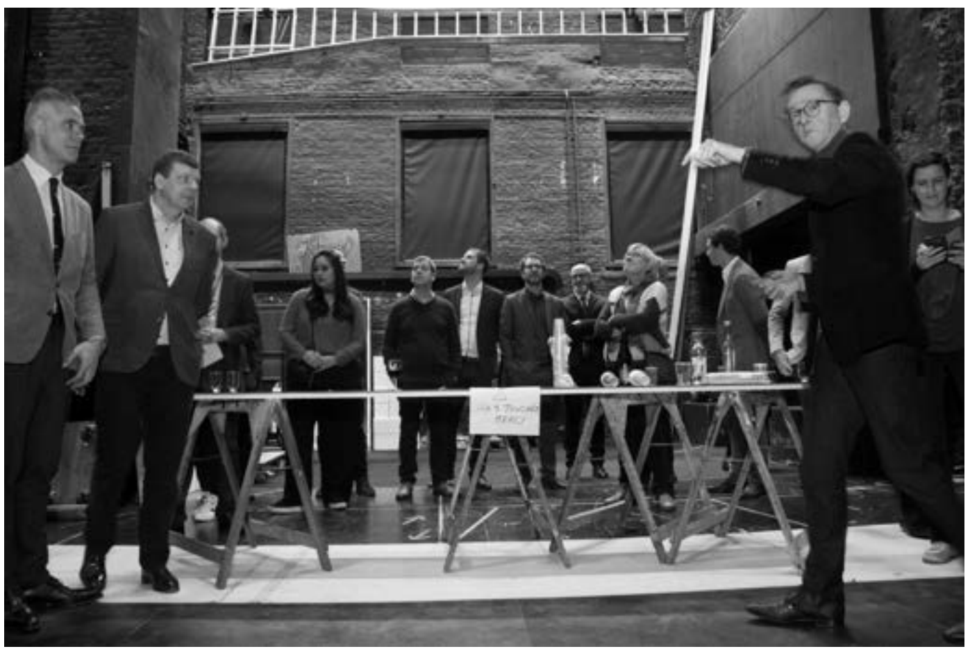
Belgium. Visit by the Committee on Public Enterprises and Federal Institutions to La Monnaie/Muntschouwburg in Brussels.