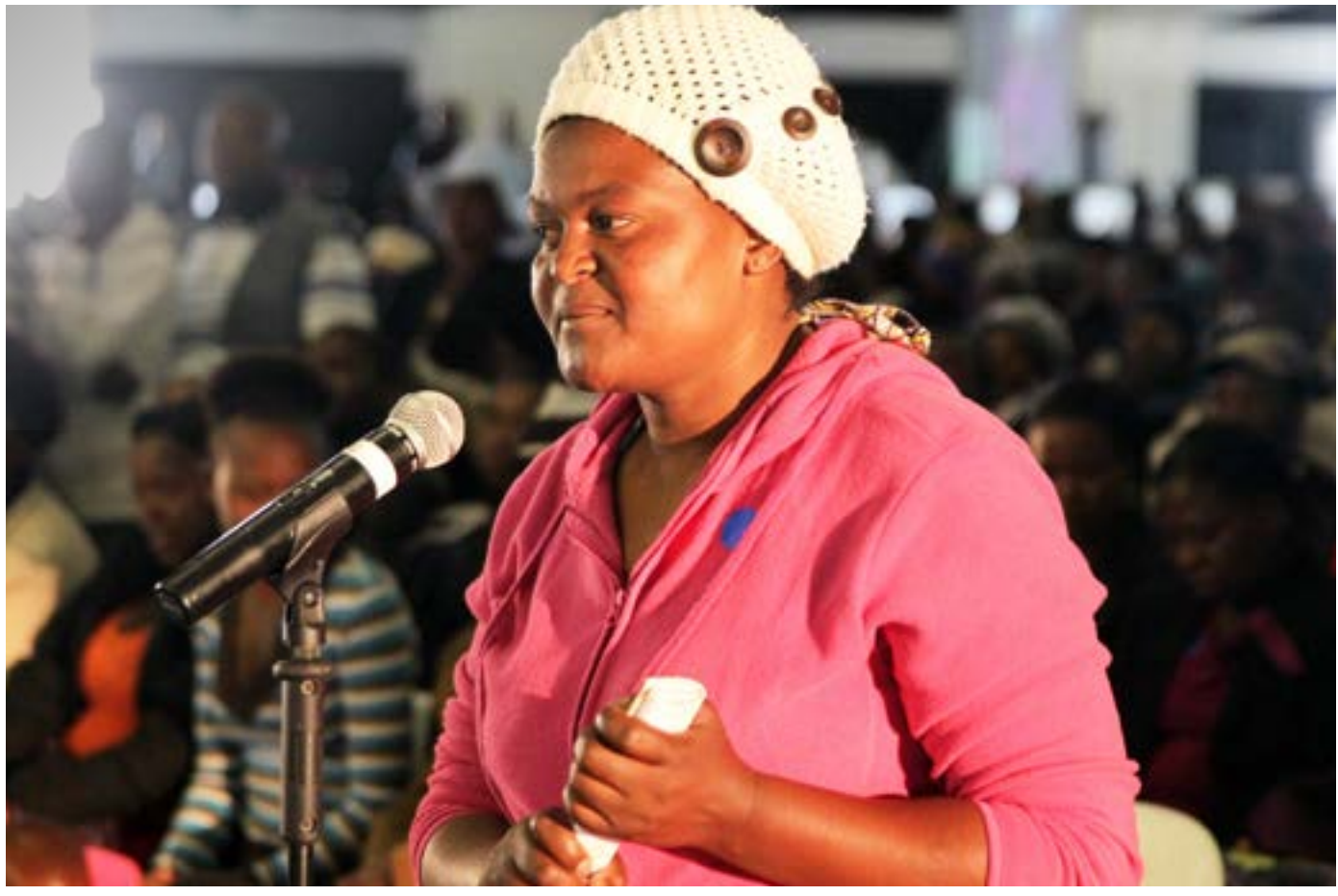
Socio-Economic Development through oversight and public participation, Mpumalanga, Gert Sibande District Municipality, Carolina, Silobela Stadium. Submissions and questions by the members of the public and responses by the government officials.