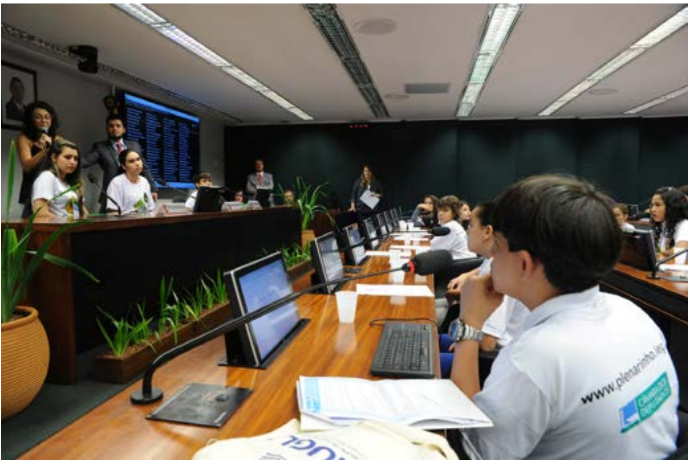
Children learning the dynamics of the legislative process in a playful way in the Chamber of Deputies.