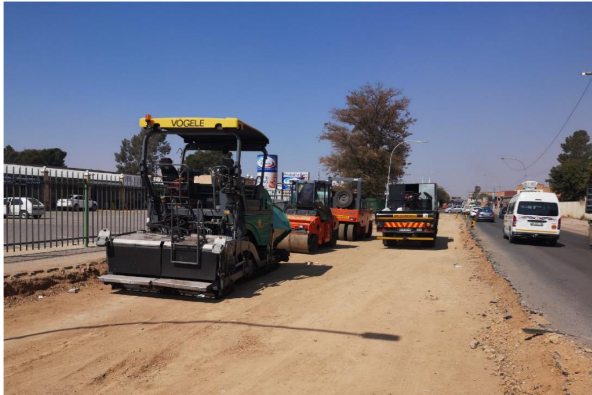
PAVING TEAM ON SITE