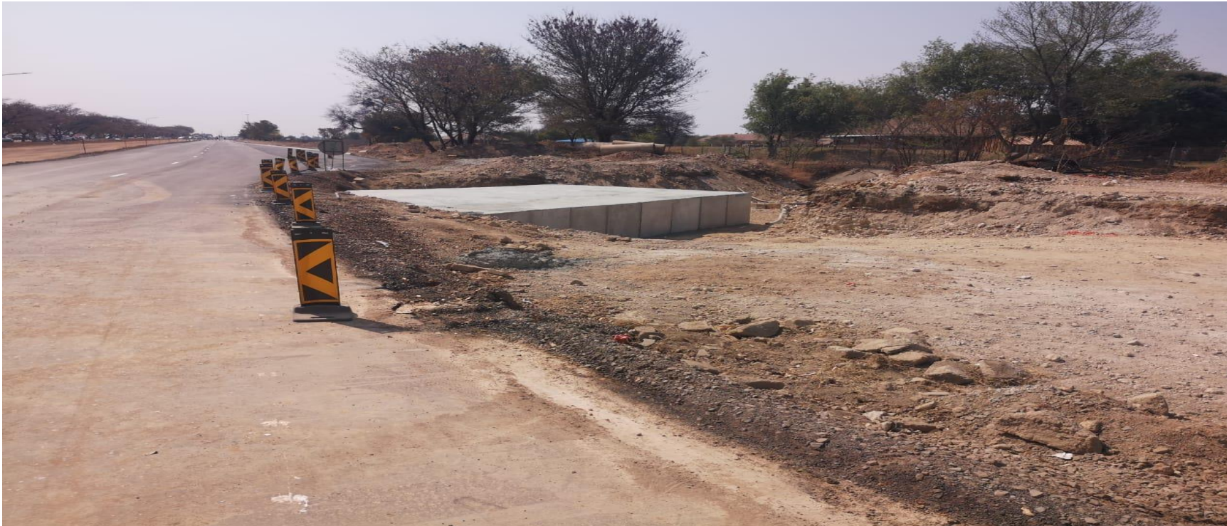
WILLIAM DICK STORMWATER