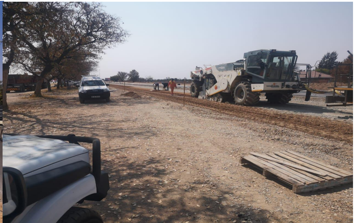
RECYCLER STABILISING SUBBASE