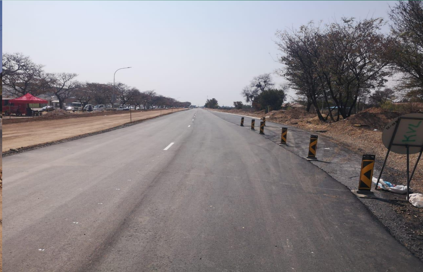
PAVED SECTION AERODROME TO WILLIAM DICK