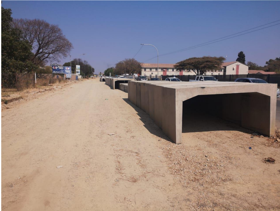
Portable Culverts on Site

Department: Public Works and Roads North West Provincial Government REPUBLIC OF SOUTH AFRICA