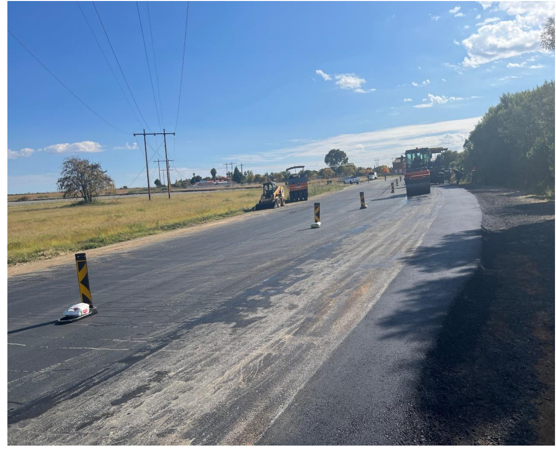
CONSTRUCTION OF A 20/10MM DOUBLE SEAL