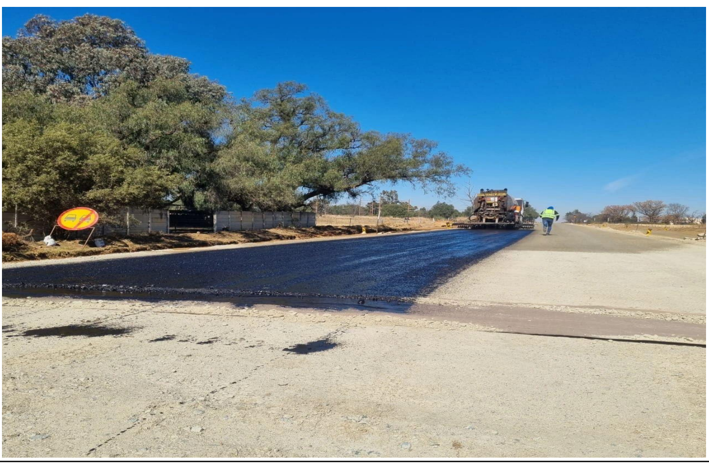
IMPORTING OF G1 CRUSHED STONE