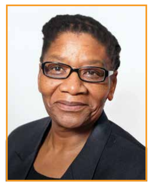
CHAIRPERSON OF THE NATIONAL COUNCIL OF PROVINCES: Ms Thandi Modise