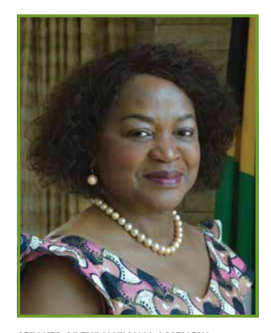
SPEAKER OF THE NATIONAL ASSEMBLY: Ms Baleka Mbete