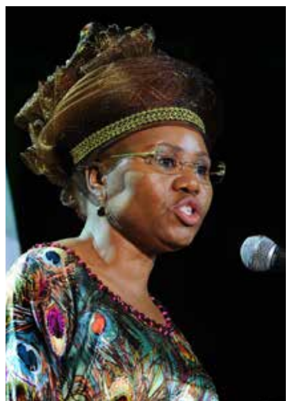
Minister of Small Business Development: Ms Lindiwe Zulu