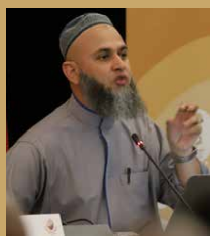
MAKING A POINT: LSSA leader addressing a plenary session.

Below: Group photograph of Speakers and Deputy Speakers