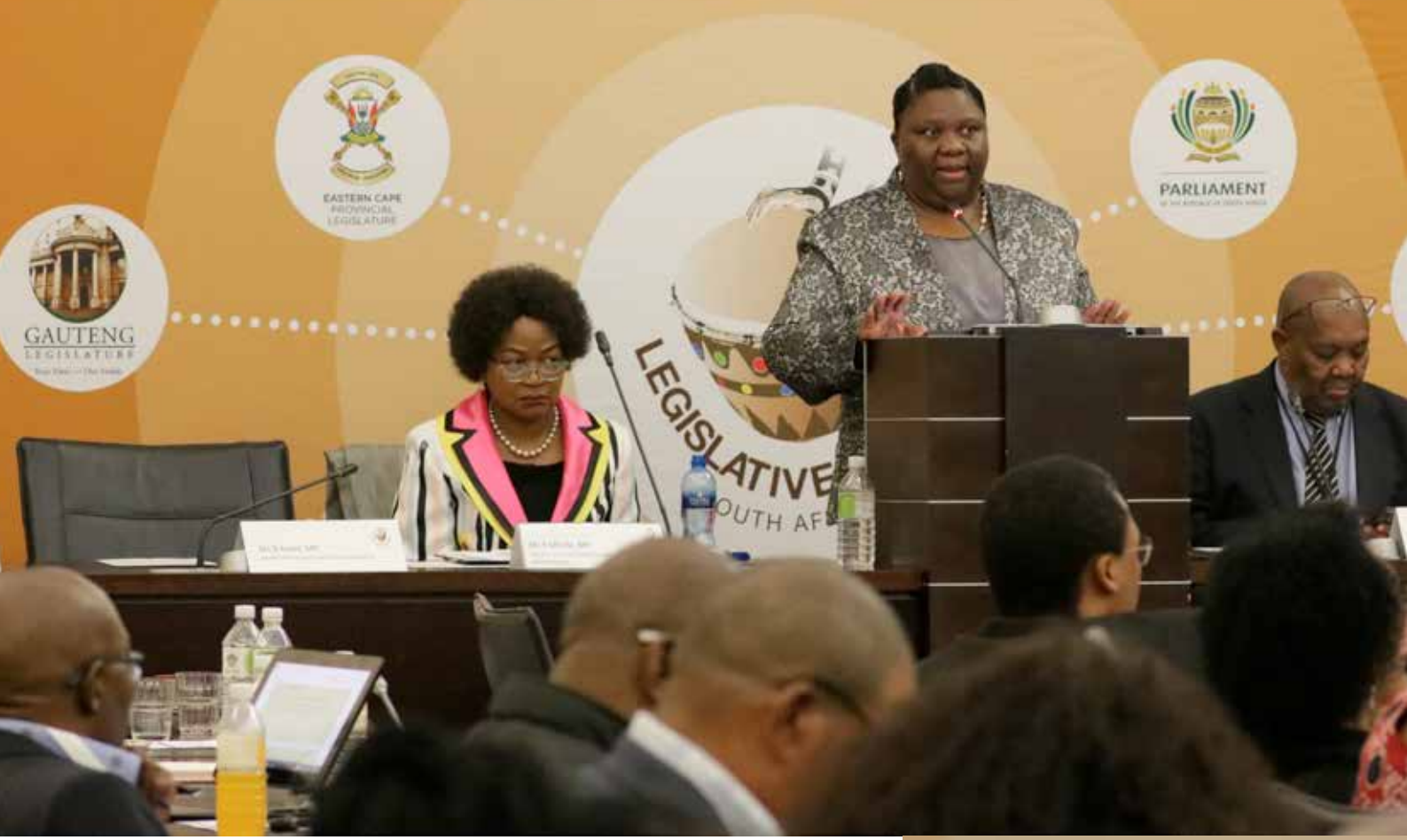
PAVING THE WAY: The Speaker of the eastern Cape Legislature Ms Noxolo Kiviet chairing a plenary session of the summit