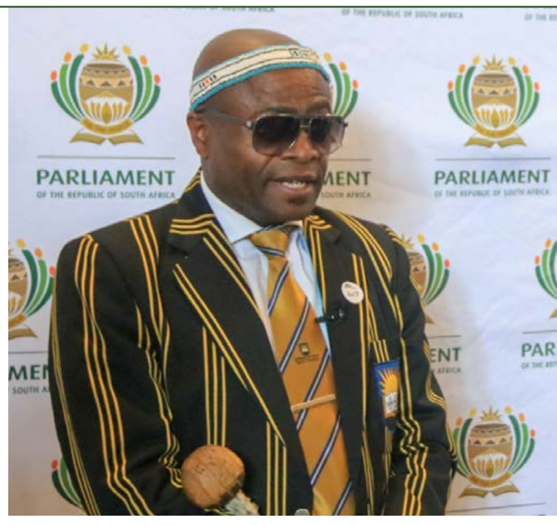
Prince Zolile Burns-Ncamashe

The Kings of AbaThembu and AmaRharhabe welcomed and embraced the delegation of the Joint Constitutional Review Committee conducting public hearings in the Eastern Cape on the possibility of amending section 25 of the Constitution to expropriate land in the public interest without compensation, writes Mava Lukani.