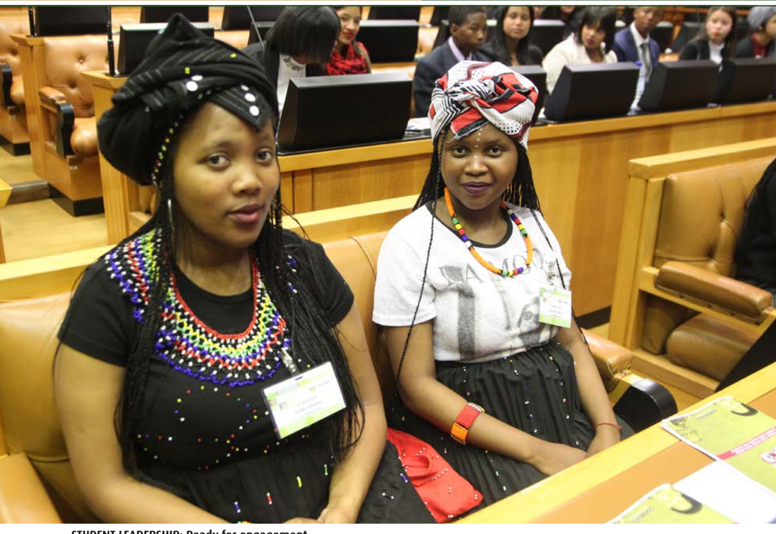
STUDENT LEADERSHIP: Ready for engagement