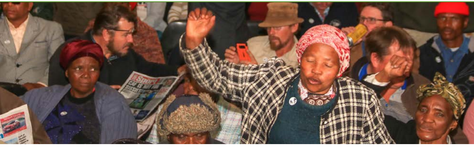
OR Tambo women demand land.