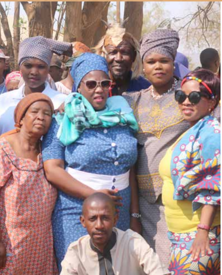
GREAT CELEBRATION: Gopane women danced during celebrations to mark the initiation of women. Gopane Royal family welcomed initiates.

villages. The women initiation process was started by three Kgotla clan women.