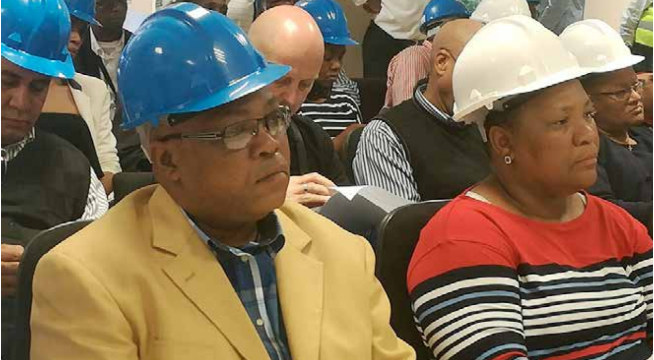
HARD AT WORK: The Deputy Chairperson of the NCOP, Mr Raseriti Tau and other members of the delegation conduct oversight in the Northern Cape during Provincial Week.

and interventions in factories and expanded public works projects. It also allows participants to undertake oversight visits to labour programmes and large-scale investment projects in electricity, rail, water and transport infrastructure and get a broader understanding of the economic challenges facing the provinces.