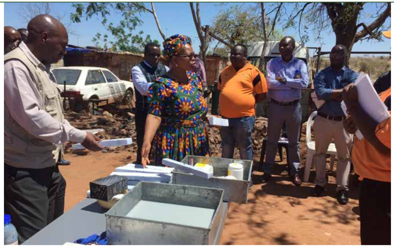
RESOURCEFUL: In Limpopo, the NCOP delegation visited the Zwithini food and soap production facility in the Vhembe district.

Shiloh Irrigation Scheme in the Enoch Mgijima Local Municipality, among other sites.