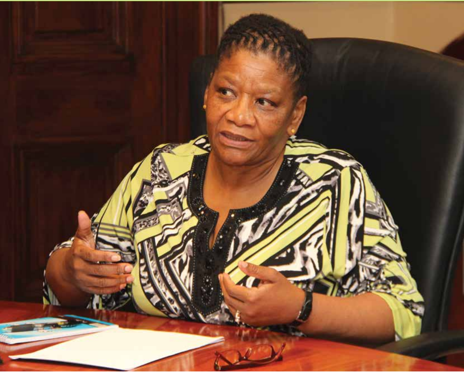
WORKING FOR THE PROVINCES: The Chairperson of the National Council of Provinces, Ms Thandi Modise.

Later on there were break-away sessions of various cluster committees whose aim was to harness their operations and rationalise their efforts to heighten the impact of their oversight work.