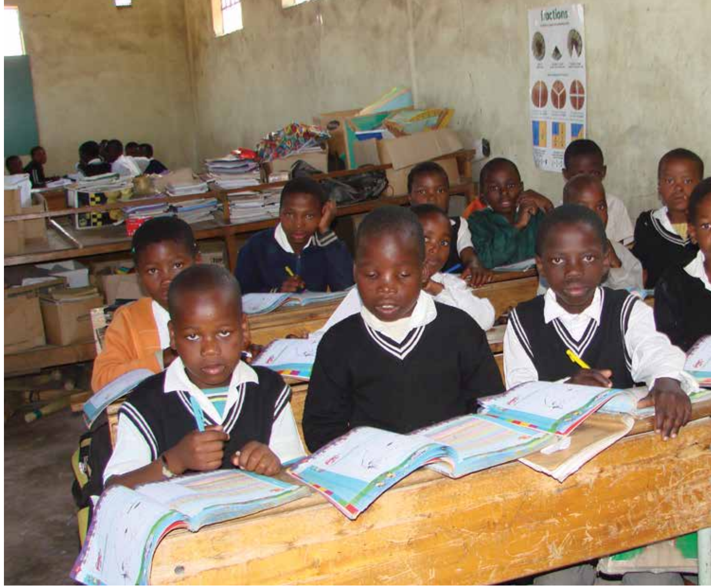
EDUCATION FOR ALL: South African children all have access to basic education, but the quality of that education varies.