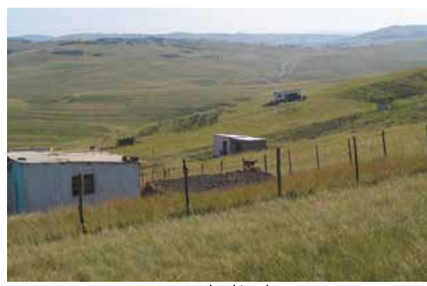
RURAL COMMUNITIES: Access to land is a key element in government plans to uplift the poor.

President Zuma also recognised the impact of the drought on economic growth. "One of the domestic constraints to growth in our country currently is the severe drought. It