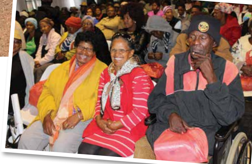
MAKE YOUR VOICE HEARD: Members of the public attend a public hearing.

Other issues affecting members of the community not captured by submissions will be covered by undertakings made by various representatives of national, provincial and local spheres of government during the public hearings of the 2015 Taking Parliament to the People programme. People wishing to make further submissions will be given an opportunity to do so during the public hearings.