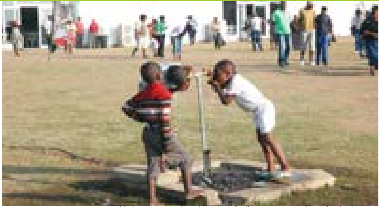
IS IT SAFE TO DRINK?: Opponents of fracking are concerned that the process will pollute nature reserves of water found underground.