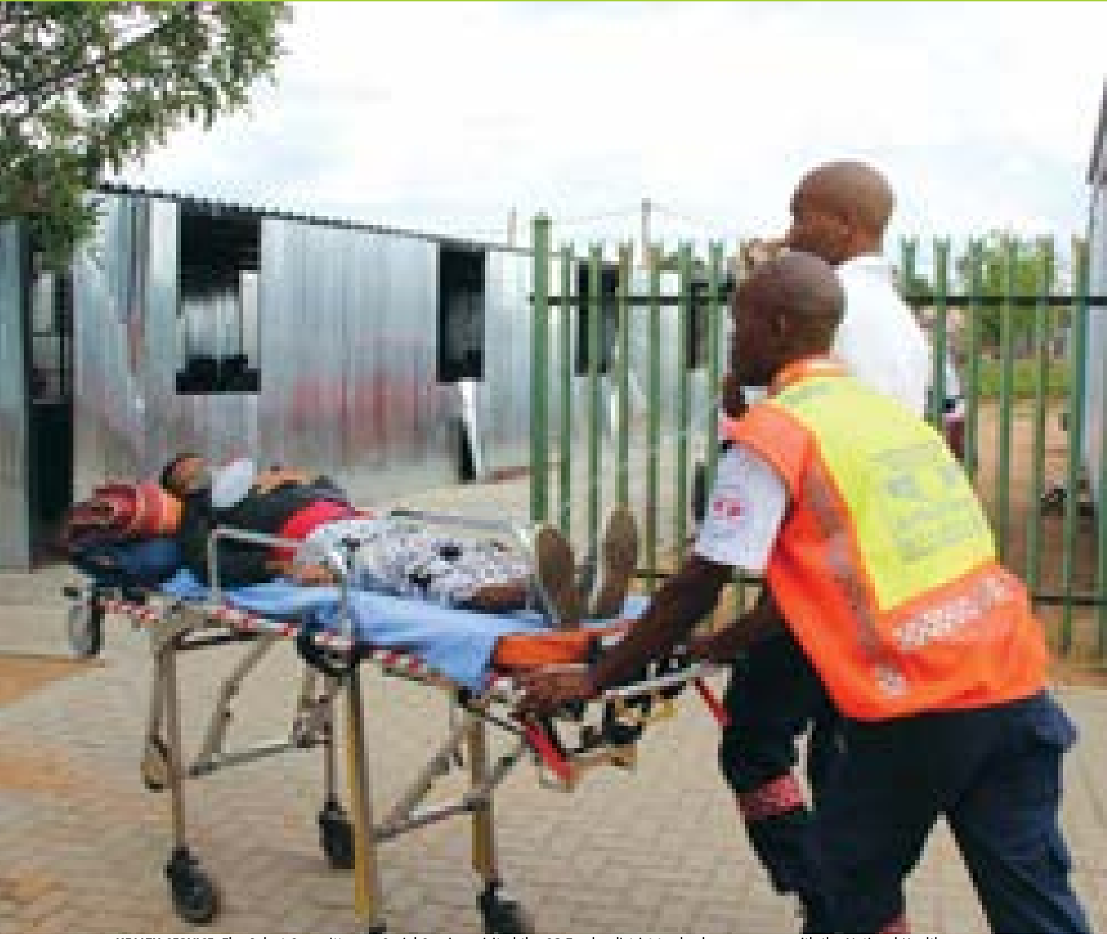
HEALTH SERVICE: The Select Committee on Social Services visited the OR Tambo district to check on progress with the National Health Insurance pilot project.

said the year's syllabus was still not completed. They also complained about the quality of teaching.