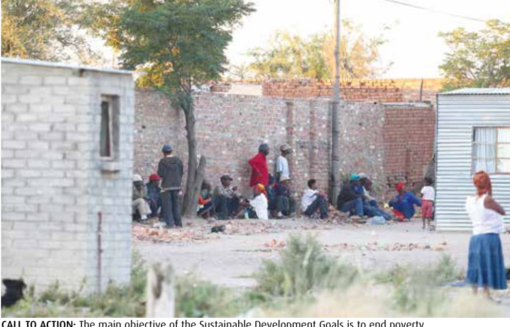
CALL TO ACTION: The main objective of the Sustainable Development Goals is to end poverty.

eight Millennium Development Goals (MDGs) – which range from halving poverty rates to halting the spread of HIV/Aids – are approaching the 2015 deadline. Working with governments, civil society and other partners to build on the momentum generated by the MDGs and to carry on with the development agenda beyond 2015, the United Nations (UN) has formulated and released what it calls Sustainable Development Goals (SDGs). Faith Kwaza reports.