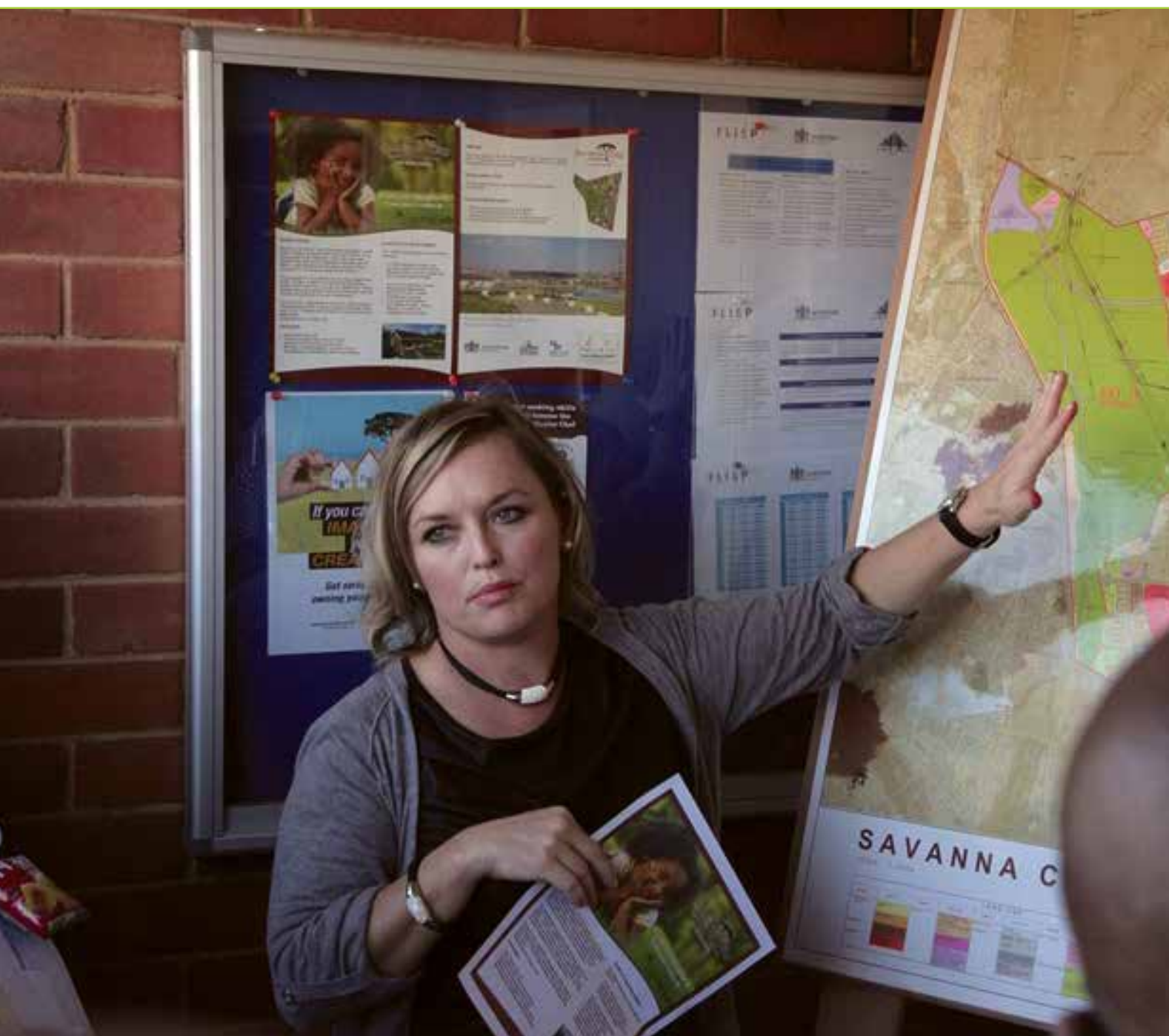
DELIVERY: A member of the Savanna Housing Development Project in Gauteng explains the different phases of a housing development.