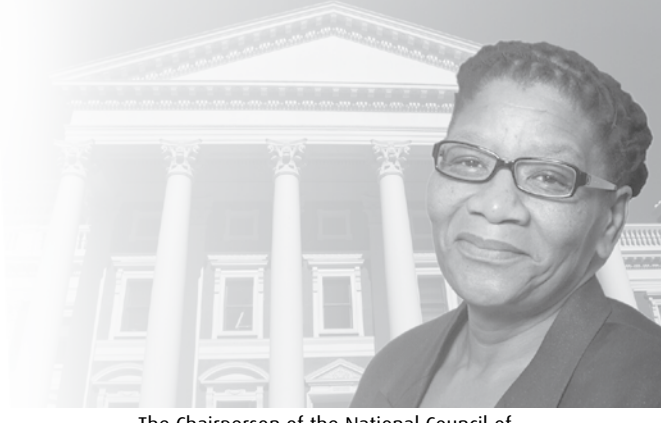
The Chairperson of the National Council of Provinces, Ms Thandi Modise