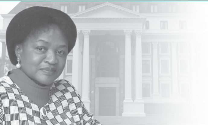
Speaker of the National Assembly, Ms Baleka Mhete