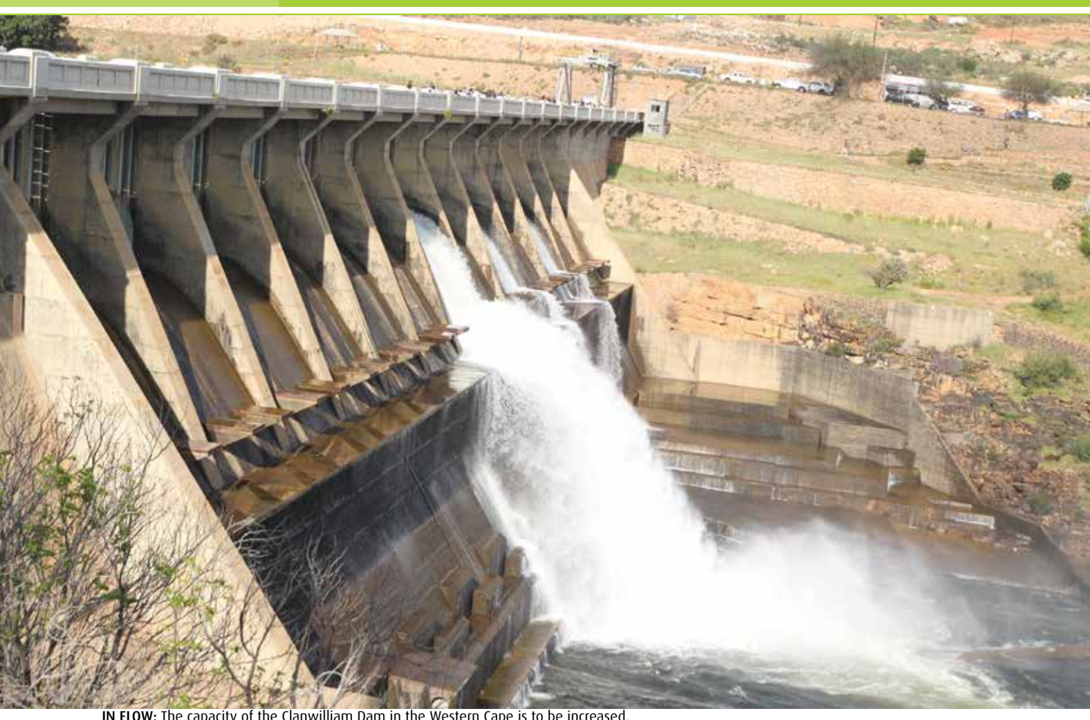
IN FLOW: The capacity of the Clanwilliam Dam in the Western Cape is to be increased.

that it has not proved as successful as had been hoped.