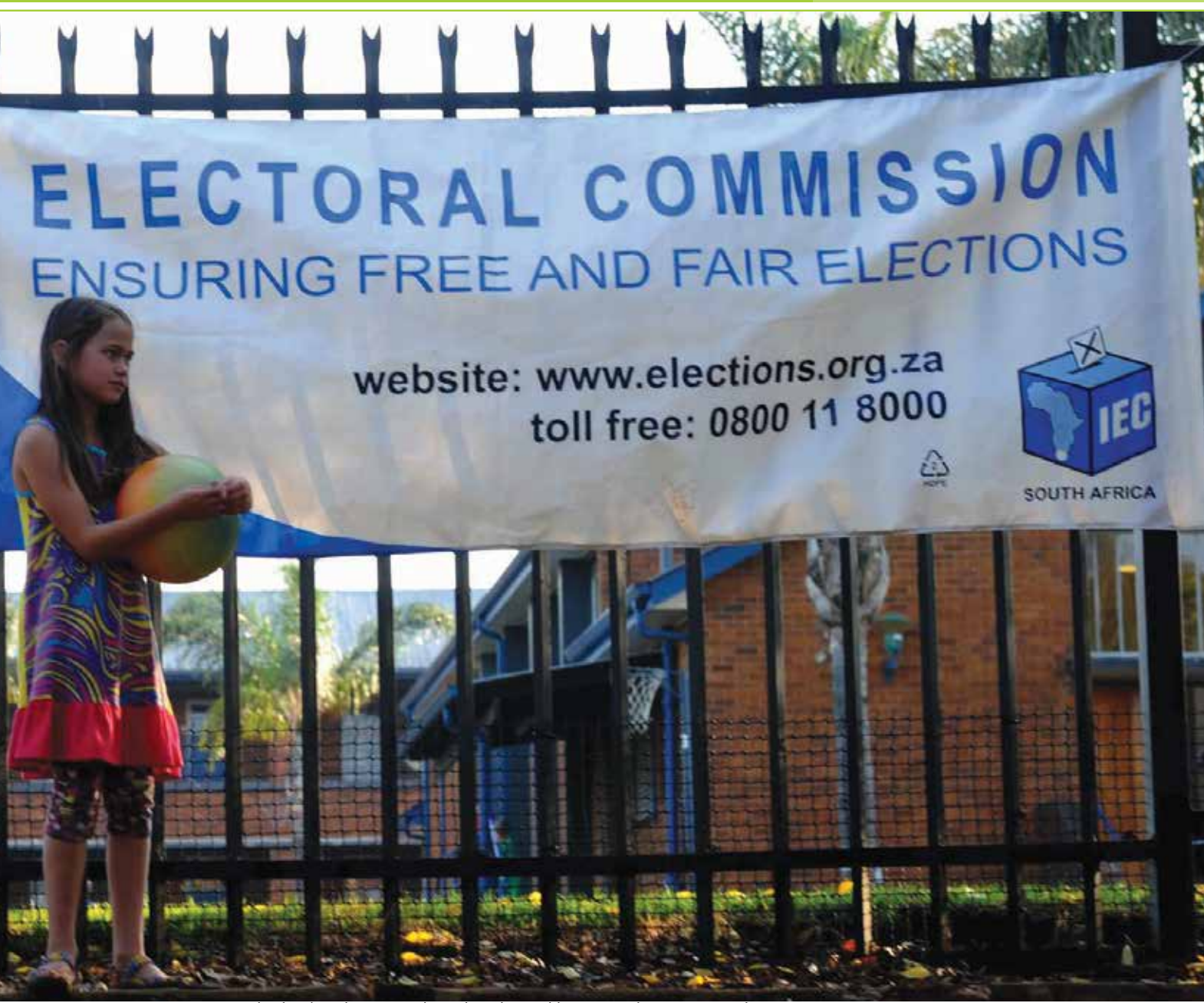
FUTURE VOTER: South Africa's Parliament ranks 10th in the world in terms of representivity for women.

among the world's top 10 countries to have significant numbers of women in Parliament, according to 2014 Inter-Parliamentary Union statistics.