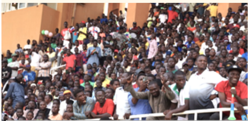
Coup supporters gather at a stadium in Niamey, Niger, August 6, 2023.

"Niger's armed forces and all our defense and security forces, backed by the unfailing support of our people, are ready to defend the integrity of our territory," he