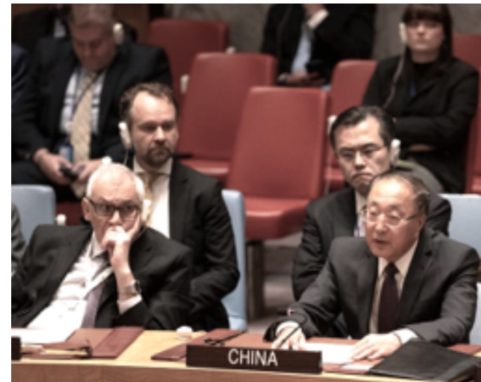
Zhang Jun, China's permanent representative to the United Nations, speaks at an emergency meeting of the Security Council at the UN headquarters in New York, on June 6, 2023.

Since the beginning of this year, over 100 Palestinians, including children, have lost their lives in conflict. Israel also suffered civilian casualties. On Thursday, Israeli forces