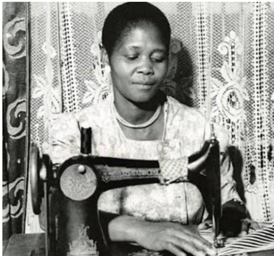
Mme Masediba Lilian Ngoyi, qhoku ya ntwana ya boitseko. E bile mosadi wa pele ho kgethwa boemong ba Boetapele ba Naha ba ANC ka 1956, ho latela boitelo le mafolofolo a hae ntweng ya boitseko.

Setshwantsho: SABC File Pic., budget-accommodation-port-elizabeth website