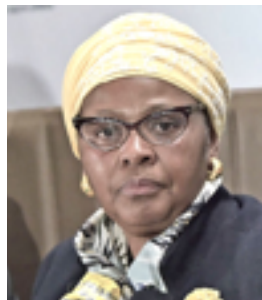
Speaker, Nosiviwe Mapisa-Nqakula.

The Legislative Sector to develop a stakeholder engagement plan and partnership framework inclusive of all sectors at all levels, business and community-based organizations to advance gender mainstreaming in South Africa.