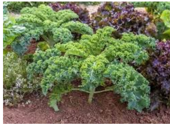
Kale e rata mobu o motle oo metsi a monyelang ha bonolo. E rata hape kganya ya letsatsi empa e ka hola hantle le moo ho seng moriti o mongata