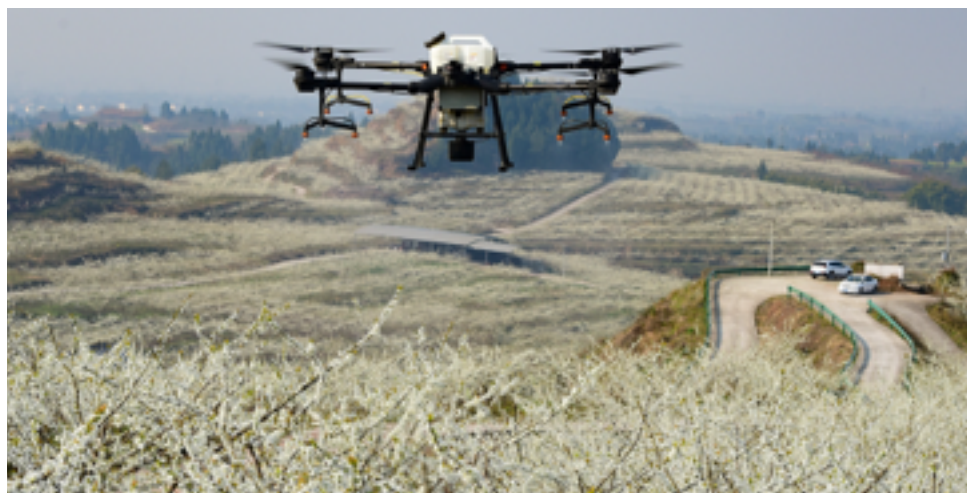
A drone helps pollinate plum trees in an orchard in Nanchong, southwest China's Sichuan Province, February 22, 2021.