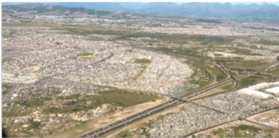
An aerial view showing the other side of Cape Town that indicates an endemic spatial inequality and segregation evident in the ever cramped settlements of African people.

"An open market economy, rather than a developmental state, makes possible an open opportunity society for all." There is no conceptual clarification of what exactly is an "open opportunity for all" because it is common