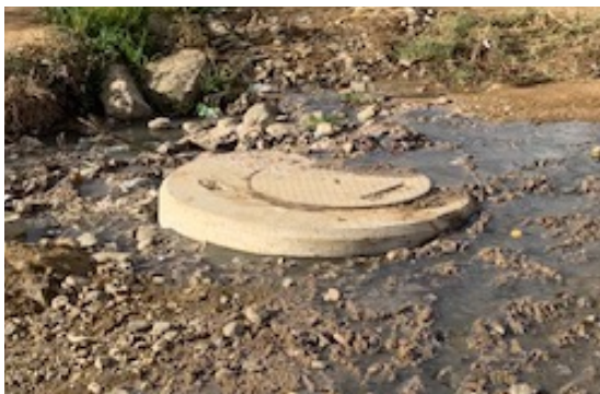
Phano e fokolang ya ditshebetso le ho se lokiswe ha marangrang di bakile maemo a hloabaetsang metseng ya Masepala wa Mangaung

ba ANC ka hara masepala. Diteko tse na di bile tsa kenyeletsa le bonamodi bo phahameng bo kenyeleditseng ditho tse phahameng tsa ANC; benghadi Thabo Mbeki, Kgalema Motlanthe le David