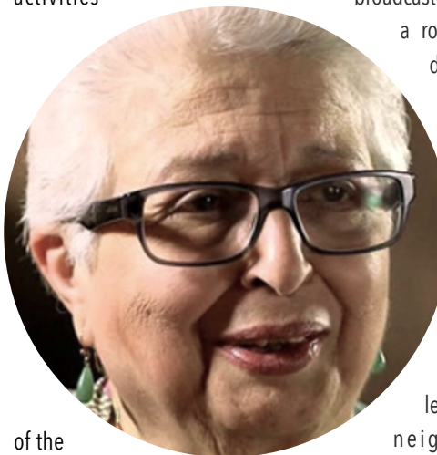
of the Congress Movement.

young age despite significant gender barriers women activists faced. She defied all the odds and the limitations society imposed on young girls. Knowing well that the struggle for freedom and against injustice also required pursuit and advancement of knowledge, she left the country to pursue her studies in Bachelor of Laws at the University of London. She would later complete her Doctorate in Philosophy at the University of Oxford before returning to South Africa in the 1950s to carry on with the liberation struggle programmes and activities