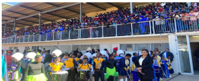
Magnificent Wednesday School Sports League finals – Dr Rantlai Molemela Stadium 2022

Districts launches followed; with Fezile Dabi District launching at Parys on the 06 th May 2022 with 2000 learners from around Parys schools attending the launch. Lejweleputswa District launched on the 18 May 2022 at Bronville stadium with 2500 learners from Bronville schools.