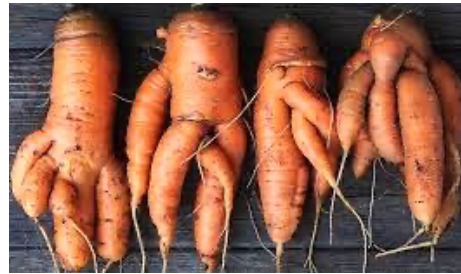
Metso e kopaneng kapa e arohaneng ya dihwete e bakwang ke tshitiso ya kgolo e ka tliswa ke bothata ba mobu ka nako e nngwe.

C, B1, B2 le carotene (Pro-vitamin A) mme di fana ka tjehebeho (mmala) e ntle dijong. Di ka jewa di phehilwe kapa di le tala. Metso ya tsona e ka ba