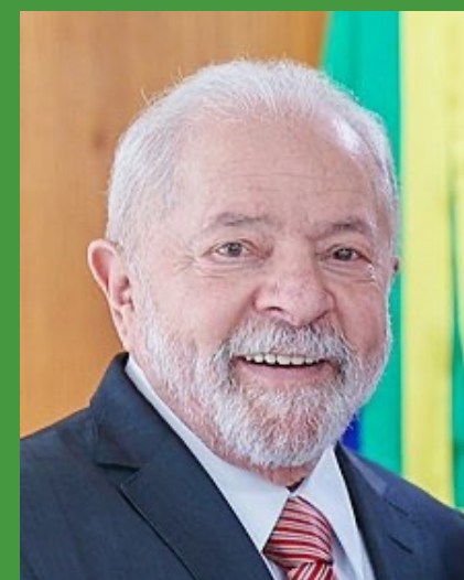
H.E President Luiz Inácio Lula da Silva