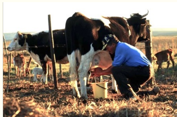
A Dairy farmer on the West Coast milks his cows.

It is further noted that smallholder dairy farming in Kenya has created jobs in transportation, processing and in trade and