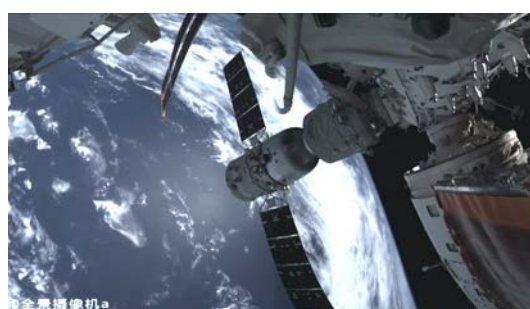
A view from China's space station, December 2, 2022.

When the plant samples return to Earth, researchers will systematically study the effects of space microgravity on plant biology through the analysis of omics and the correlation analysis of simulated microgravity experiments on the ground.