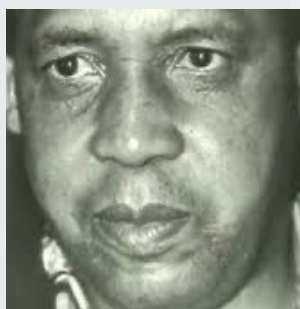
Chris Hani.

"We were deeply disappointed on 21 November 2022 when the Constitutional Court delivered a judgment ordering that the triggerman who assassinated Chris Hani in cold blood on 10 April 1993 be placed on parole within 10 days.