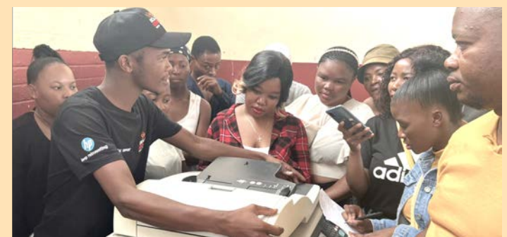
Batjha ba mametse ka tlhoko tlhahisoleseding ka metjhini ya HP