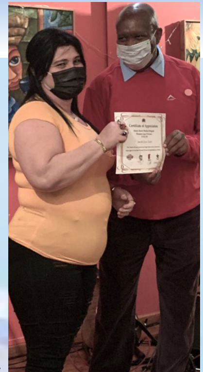
Monghadi Lechesa Tsenoli le e mong wa dingaka ba bontsha lengolo la teboho.

Ho utlwahala ha meketjana e meng e ka nna ya tshwarwa diprofensing tse ding.