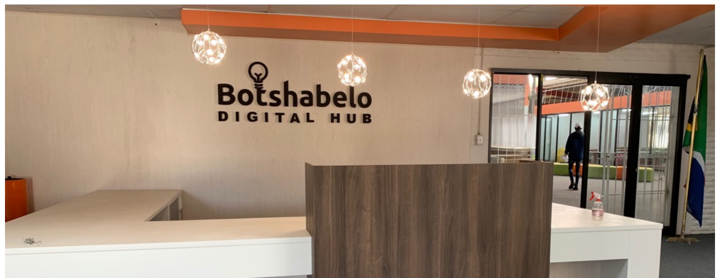
The digital hub's front desk - characterised by elegant and futuristic display will be home to many IoT enthusiasts

For the envisaged Digital Hub, training has been conducted to identify potential