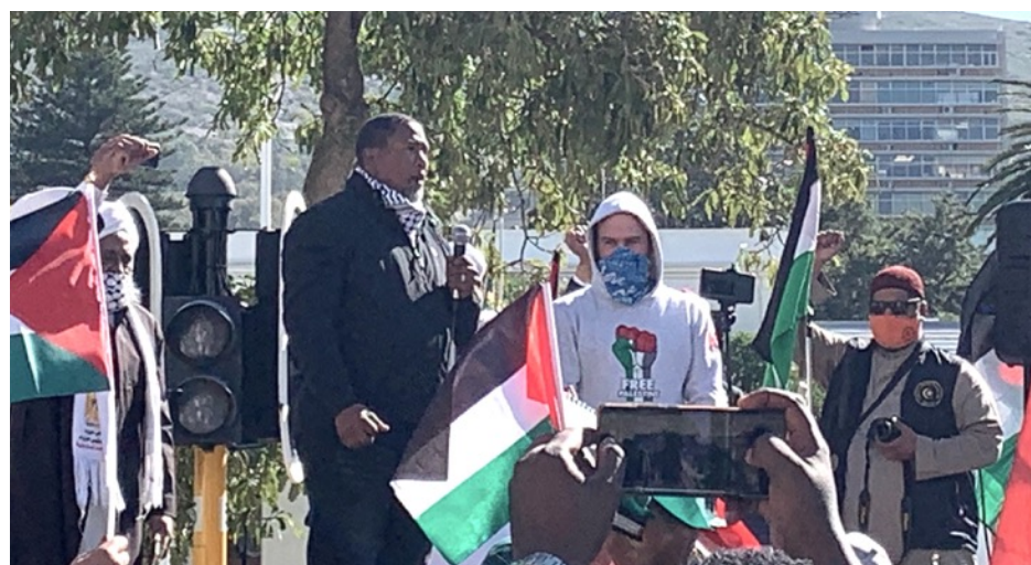
Mandela, calling on South African Government to close down the Israeli embassy and appealing to South Africans and international community to support Palestinian people.

To this day stories of forced removal, displacement, maiming and killing remain some of shameful and poignant part of our history. It was then, in the 20 th century.