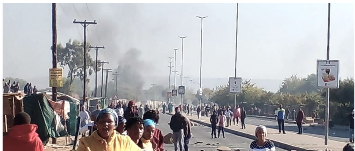
Batho ba eme matlotlosa, mme ditsela tse ngata di ile tsa kwalwa ke sepolesa ha tse ding di ile tsa thijwa ka majwe le ho tjheswa ha dithaere ho ileng ha sitisa phallo ya sephethephethe le motsamao o lokolohileng wa batho.

hanetse ho tswela pele ka mohwanto moo jwale ba neng ba lokela ho bua ka taba ya ngwana ya thuntsweng a se mohwantonng.