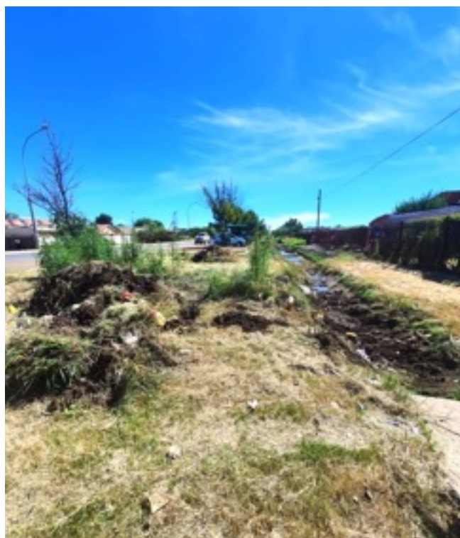
Karolo ya letsholo la ho kgutlisa seriti sa motse, mosebetsi wa ho hlwekisa tselana tsa metsi a phallang.

"Re kena ward le ward ho hlabolla le ho lokisa moo ho senyehileng. Ke mosebetsi o boima empa oo re tshepang hore