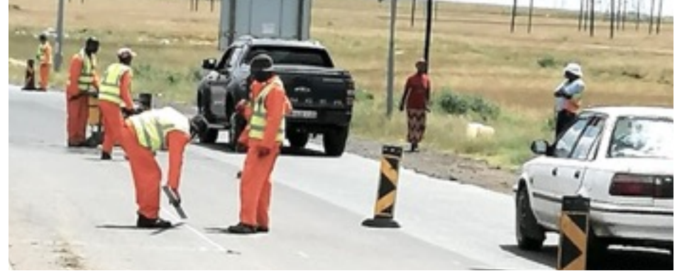
Tlhabollo ya ditsela ka hara metse ya Mangaung ke o mong wa mosebetsi e ka sehlohong.

dibakeng tse ding tema e se e ntse e bonahala. Re sebetsa ka dihlopha tse sebetsang ka boitelo tsa basebetsi ba masepala." Ho