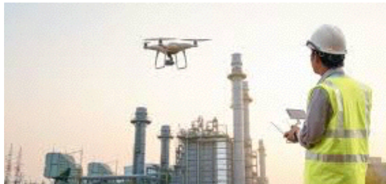
RPAS ke mokgwa o bobebe, o bolokehileng wa ho etsa mosebetsi ka nako e kgutshwane.

Difofane tsena di se ntse di sebediswa kgwebong tse itseng mona Afrika Borwa. Di tla sebediswa ka botlala nakong e tlang, mohlala; mosebetsing wa dipalopalo le dikgethong, ho laola sephethephethe, ho nka ditshwantso, ho thusa dikoduweng kapa dikotsing tse itseng, ho batla batho ba lahlehileng, ho lekola thepa le marangrang a meaho le motlakse, ditsela le marokgo diphofole le