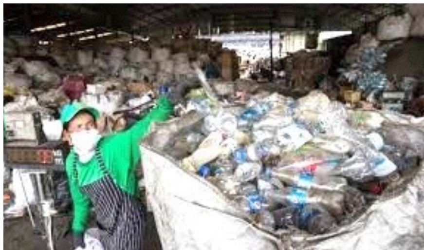
Ka morao hore a phuthwe matlakala a arolwa ho ya ka hore a entswe ka eng. Mosebeletsi o arola matlakala ka tsela e jwalo.