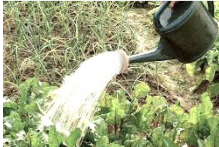
Dijalo di hloka nosetso ho fana ka tlhahiso e atlehileng.

*Monontsha/Manyolo: Dijalo ka ho fapana di hloka phepho e fapaneng ya monontsha ho ka fana ka tlhahiso e hodimo ya boleng. Ha phepho dijalong e le ngata kapa e fokola, hona ho baka kgatello dijalong. O ka romela phophi ya mobu sebakeng seo ho etswang diteko tsa mobu teng ho fumana hore ke monontsha kapa manyolo a fe ao o lokelang ho a sebedisa seratswaneng. *Ho hlaola: Hlaola kgafetsa o sa teba haholo. Qoba hore mobu o se be metsi haholo kapa ho tiha haholo. Ho hlaola ka mora pula kapa ho nosetsa ho thibela hore mobu o omelle.