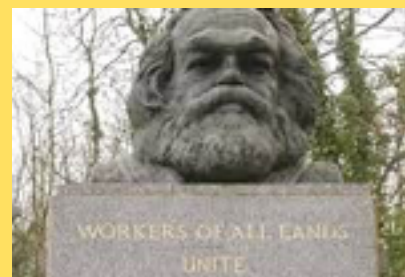
Karl Marx headstone, Highgate cemetery, London.

His name will endure through the ages, and so also will his work.