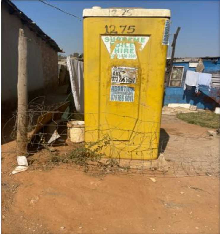
Video Settlement IS