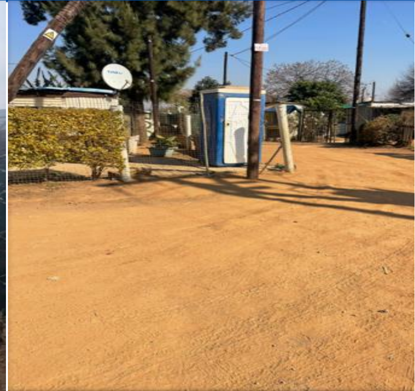
Reintfontein 189 IQ Portion 81