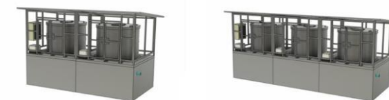
2 x Aquonic 1000 with 8000L Septic Tank