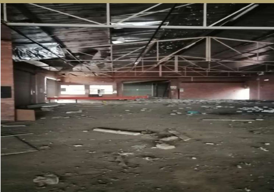
NDPW has shown interest of leasing this facility as government garage.

The property is not in a good condition, the Department is busy with conditional assessment to determine the refurbishment costs. Refurbishment will be done in 2023/24