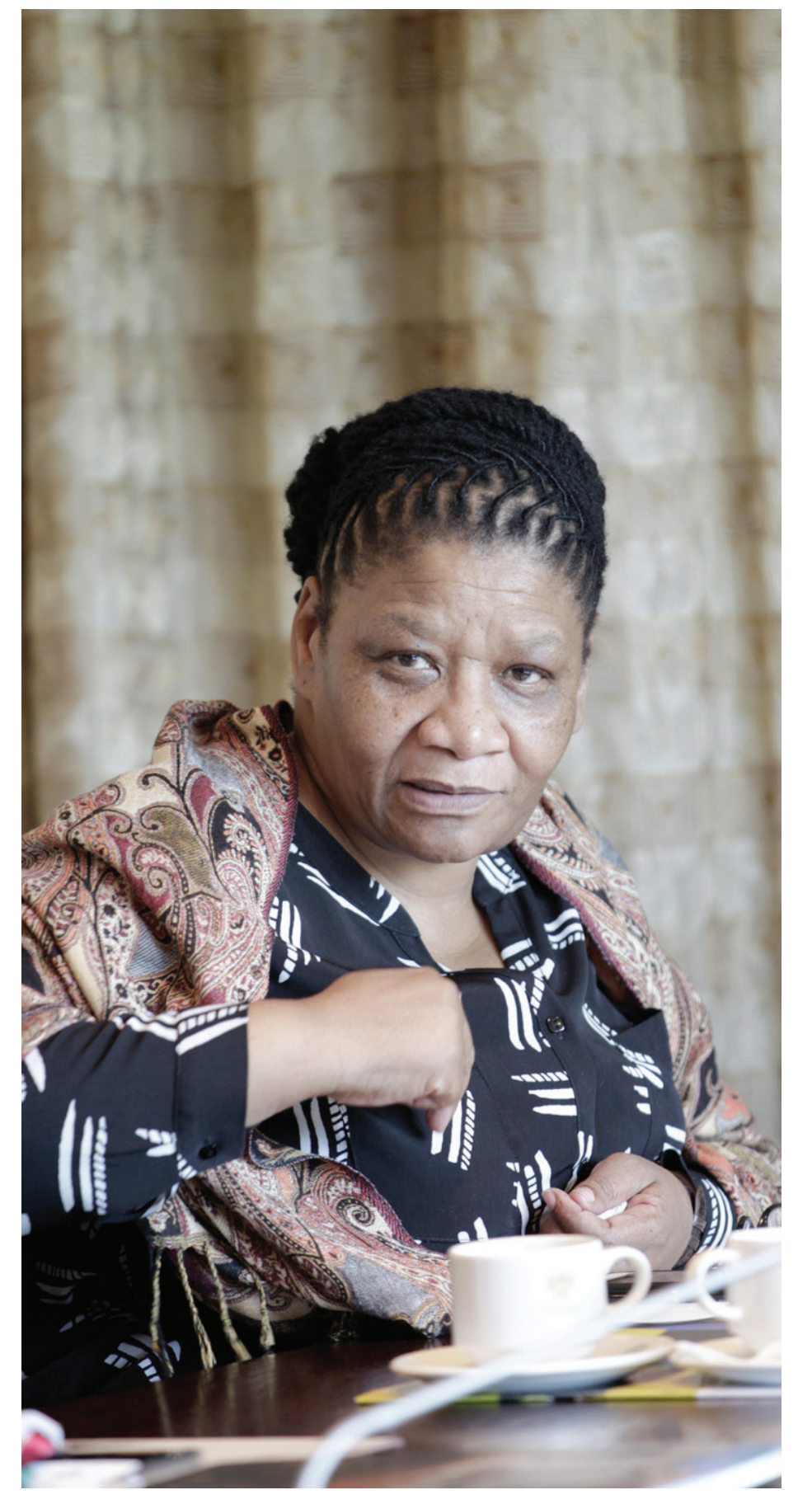
Ms Thandi Modise, Chairperson of the National Council of Provinces