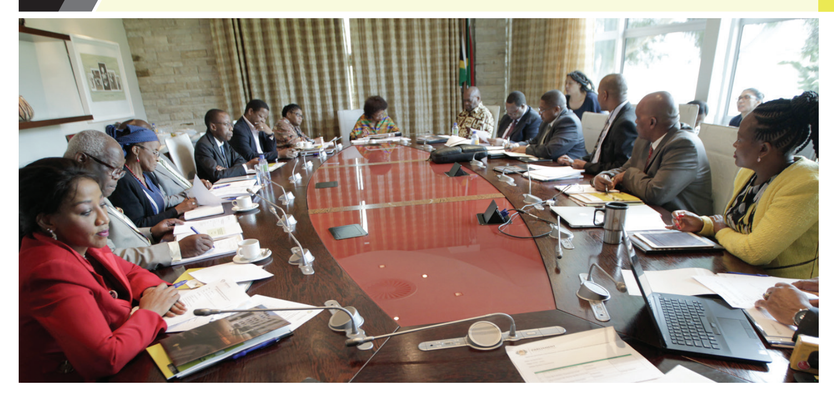
Report on the High Level Meeting between Presiding Officers and Institutions Supporting Democracy (ISDs)